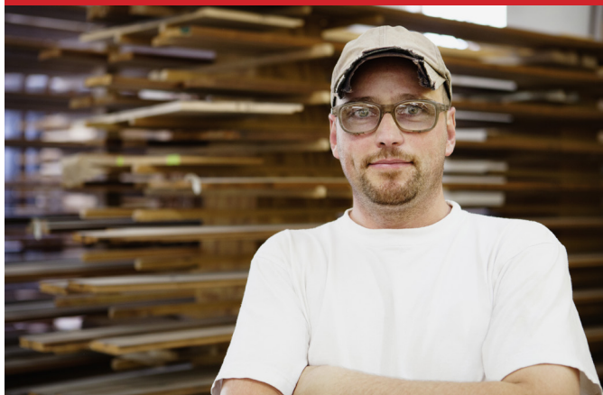
Photo not actual GSHC patient