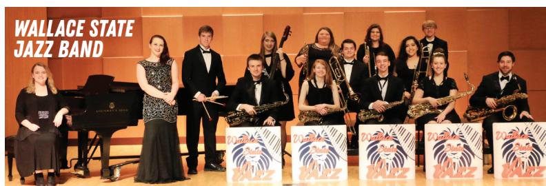
New to this year's line-up is the Wallace State Jazz Band

Make plans to attend and support a worthy cause while enjoying a great evening of entertainment. Additional concert details are available through the Clinic's fundraising event line at 256-255-5965.