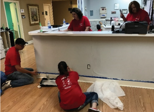
Yutaka employees give the clinic a fresh coat of paint and some deep cleaning as part of Honda's National Week of Service last summer.