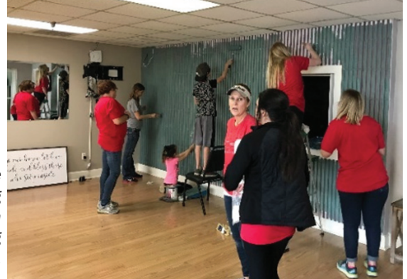
A fresh, farm-house makeover for our waiting rooms from Desperation Church volunteers during Passion Week last month.