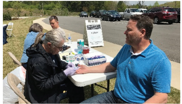
Clinic nursing volunteers provide free health screenings for Royal employees during second annual charity walk event.