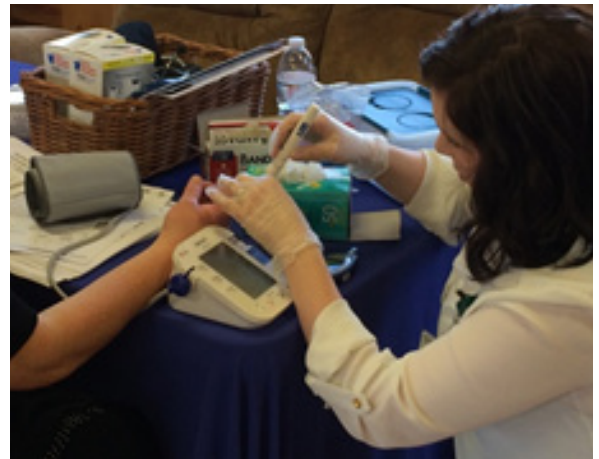
Glucose screening at community resource fair