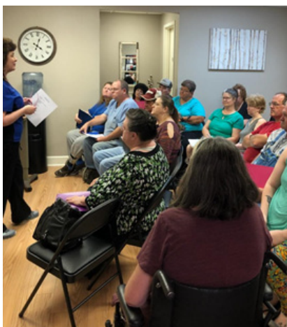
Good Samaritan patients learn valuable information on how to manage diabetes.