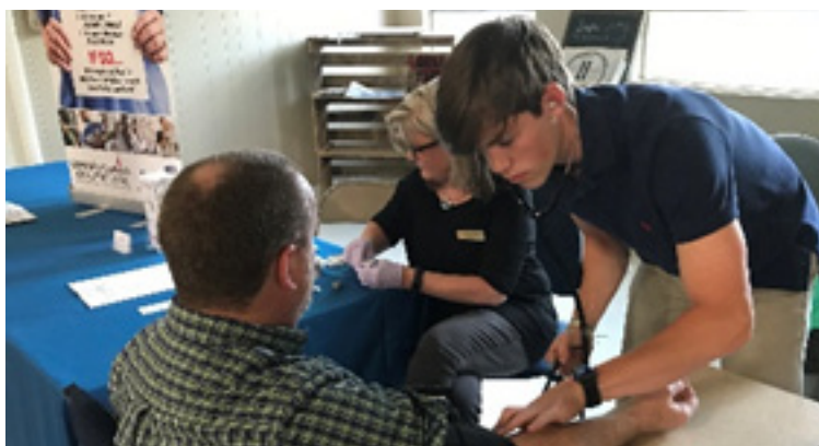
CHS student assists with community health screenings.

This summer, CHS Medical Academy students volunteered 100+ hours at the clinic triaging patients and assisting with community health screenings. To volunteer, these students completed three courses in the Health Sciences curriculum including Therapeutics and Internship and were recommended by their teacher. They are all certified BLS providers and well-equipped to fulfill their volunteer role at the clinic. Special thanks to these amazing CHS students who brightened our day and blessed our patients. Each of them has a promising future in the medical field.