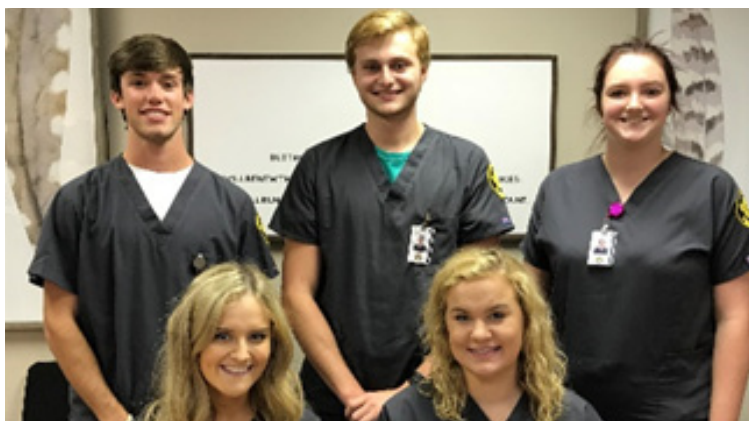
Student volunteers from Cullman High School's Medical Academy