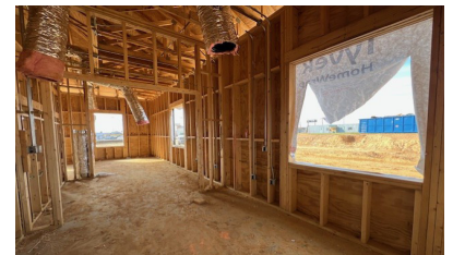
Designed for care: Expanded areas will support wellness, education, and access.

This milestone represents the generosity and commitment of our incredible community. Because of your support, what began as a vision is becoming a reality—one that will allow us to expand our reach, enhance patient care, and serve our community for many years to come.