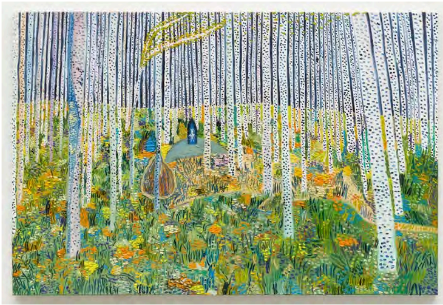
Wong's The Kingdom , at Karma.

The Golden Age is an all-yellow semi-depiction of what looks like a tree seen through a crevice. A sun hovers on a horizon; a nearby personage stands in a field of marks. The whole picture can turn into a Picasso-esque mask. (It looks a little Schnabel-esque.) This entire painting was made with only one color distributed in different values and shades, giving the work a formal grounding. Somewhere , my favorite painting here, is an orange-and-dark-blue scene of woody undergrowth. Look longer, and little robed figures come into focus, also wells, animals, someone riding a horse, a river. I imagined philosophers and prophets in some mythic garden. The painting works like a tapestry, where every part of the surface has its own retinal speed, making it difficult to read, which allows parts to come into and out of focus. Blissfully. The Realm of Appearances is an almost Hockney-like jigsaw puzzle of yellow-ocher, orange, and blue, a hilly horizon beneath a green night sky with a full pale-green moon. Spending time with it produces dreams of otherness and faraway places. Soon, I spotted trees, someone looking into a barrel, maybe a curving road and a dwelling.