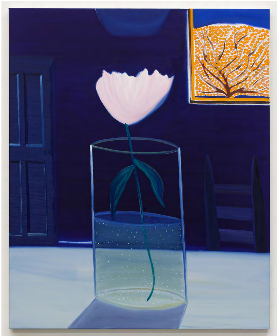
Blue Night , 2018 oil on canvas, 60 × 48 inches