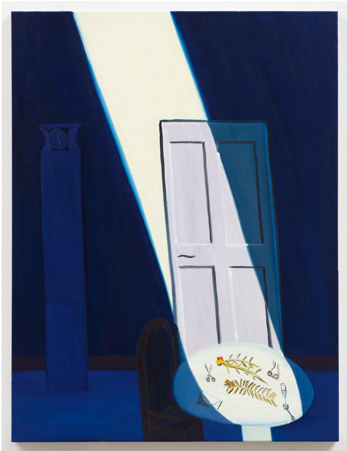
5:00 PM, 2019 oil on canvas 48 × 36 inches