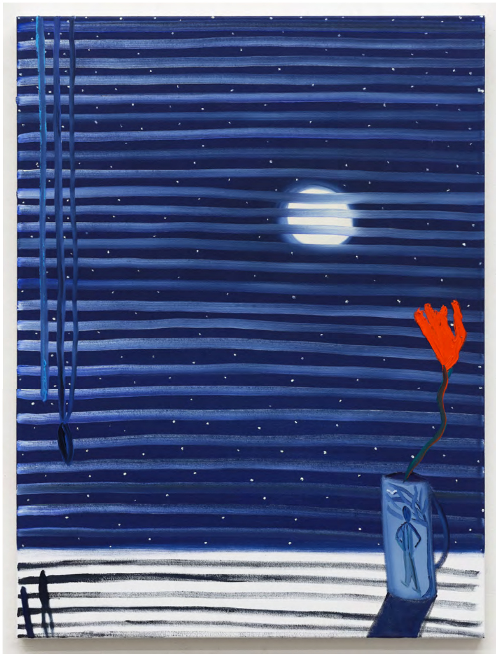
Meanwhile... , 2018 oil on canvas, 40 × 30 inches