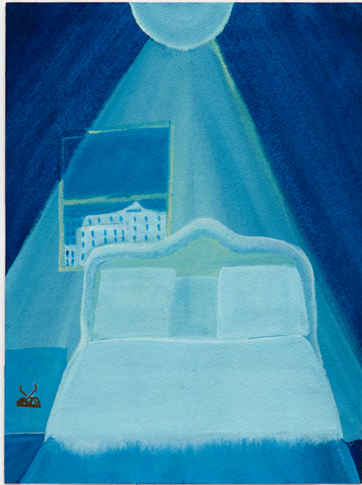
Untitled , 2019 gouache on paper 12 × 9 inches