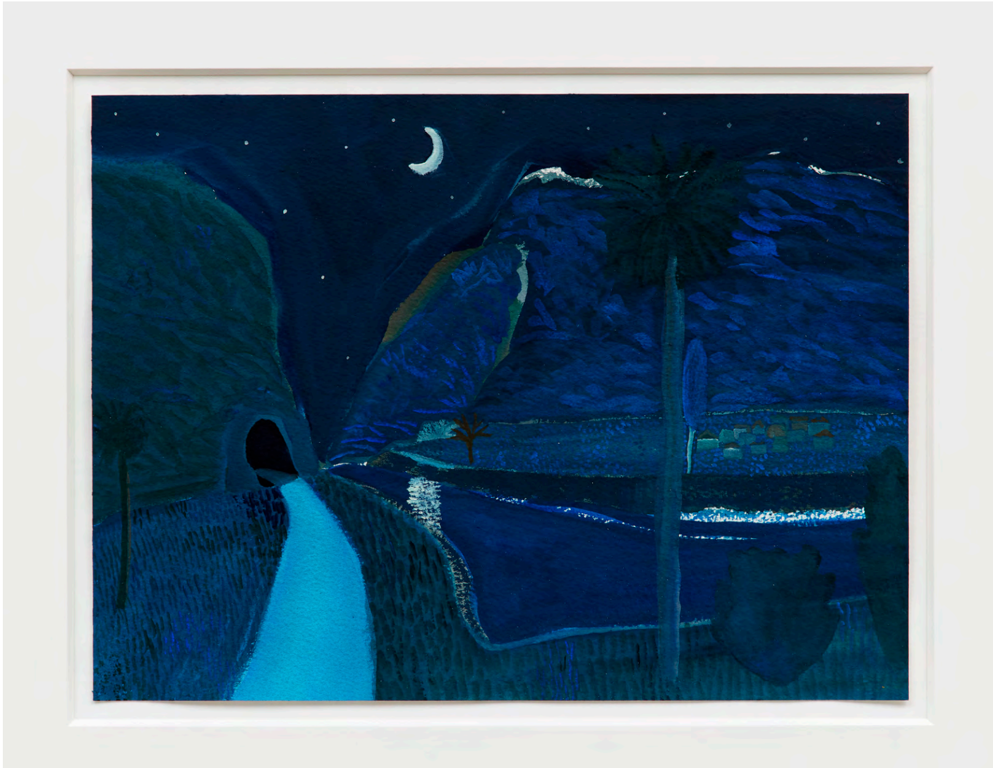
Untitled, 2018 gouache on paper 9 × 12 inches