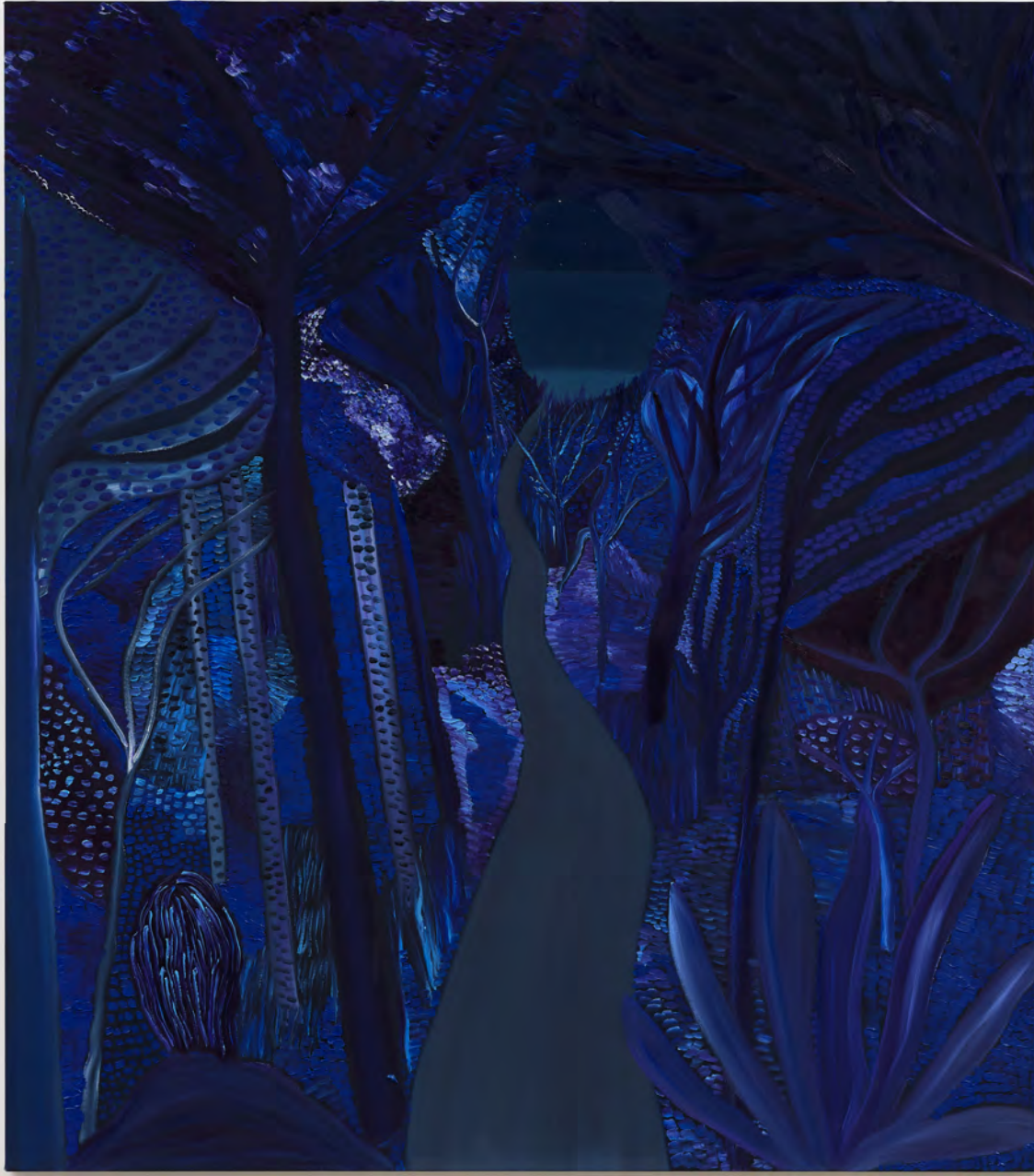
Path to the Sea , 2019 oil on canvas, 80 × 70 inches