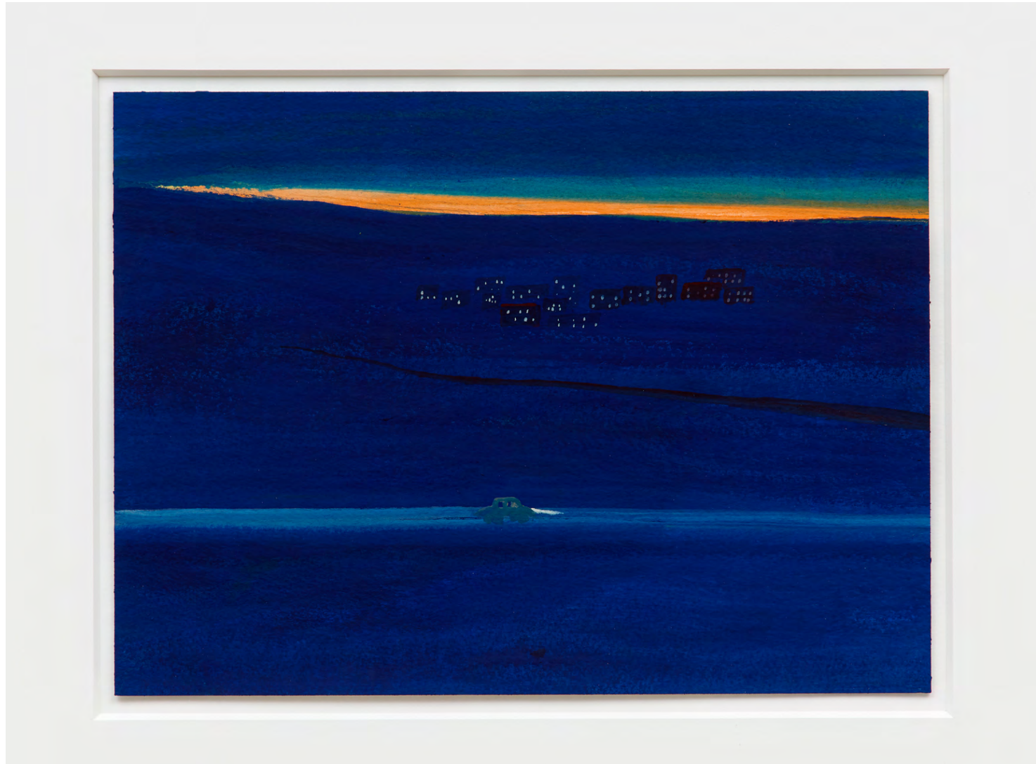
Untitled, 2018 gouache on paper 9 × 12 inches