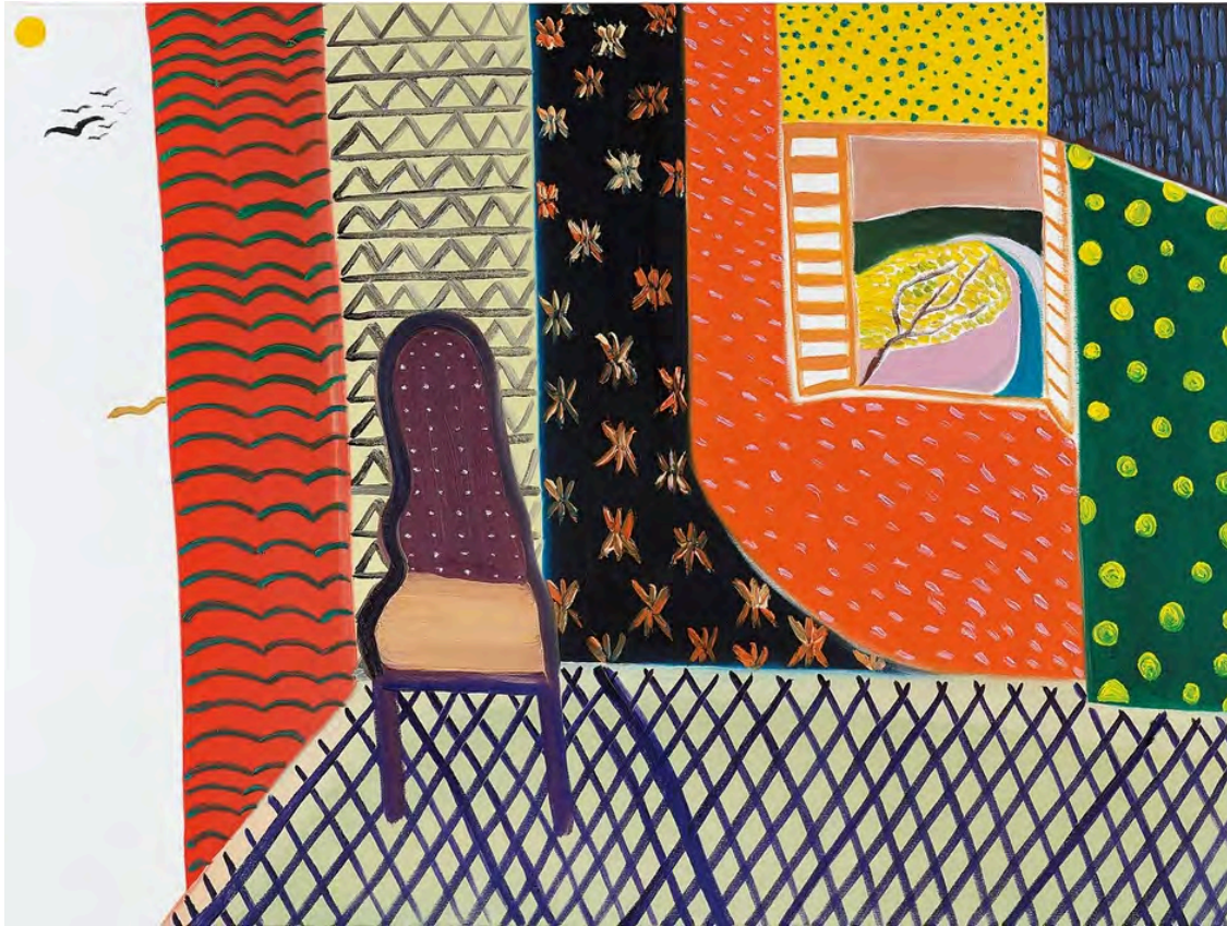
"Mood Room" oil on canvas is up for auction Thursday evening in New York.