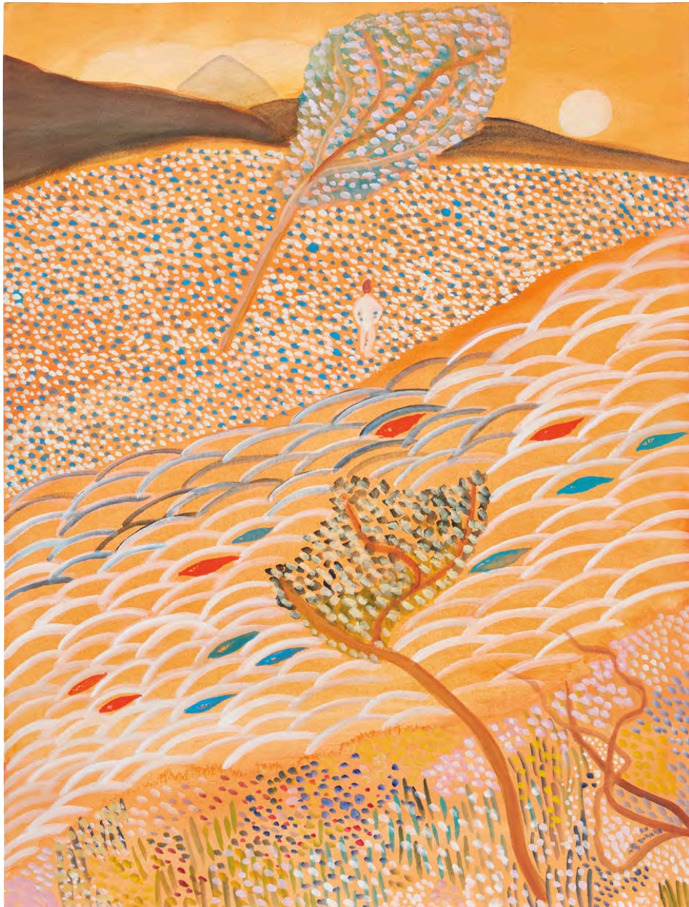
"Landscape with Young Bather" gouache and watercolor on paper sold Thursday afternoon in New York. PHOTO BY MATTHEW WONG/HANDOUT