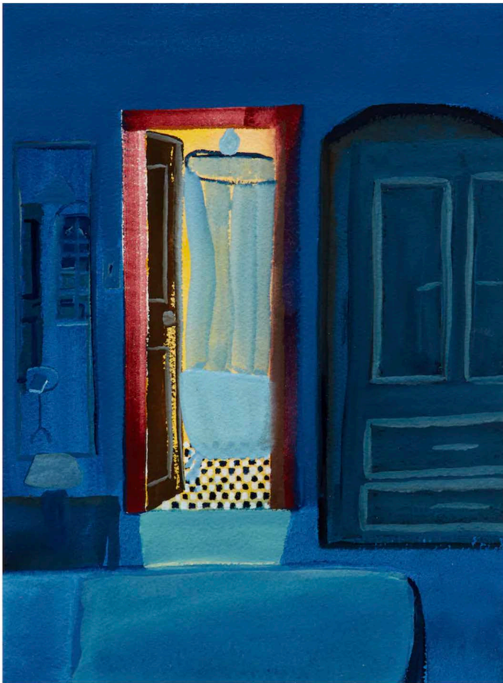
Untitled (2019), Matthew Wong. Courtesy Karma, New York; © 2019 Matthew Wong Foundation/Artists Rights Society (ARS) New York