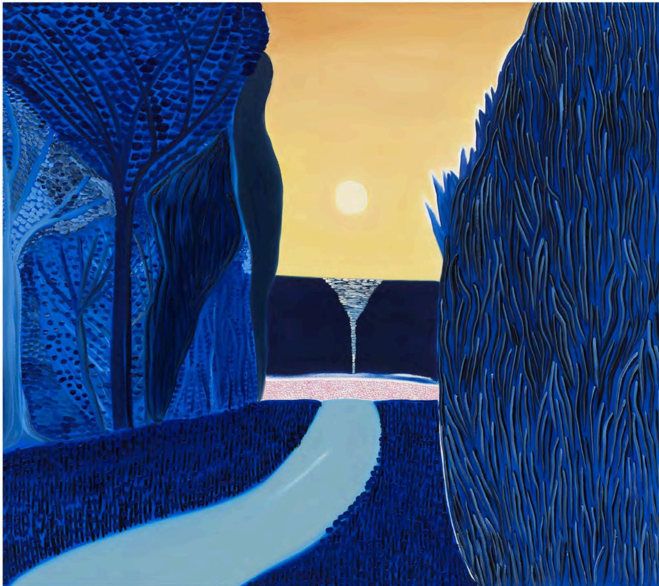
Matthew Wong, A Dream (2019).