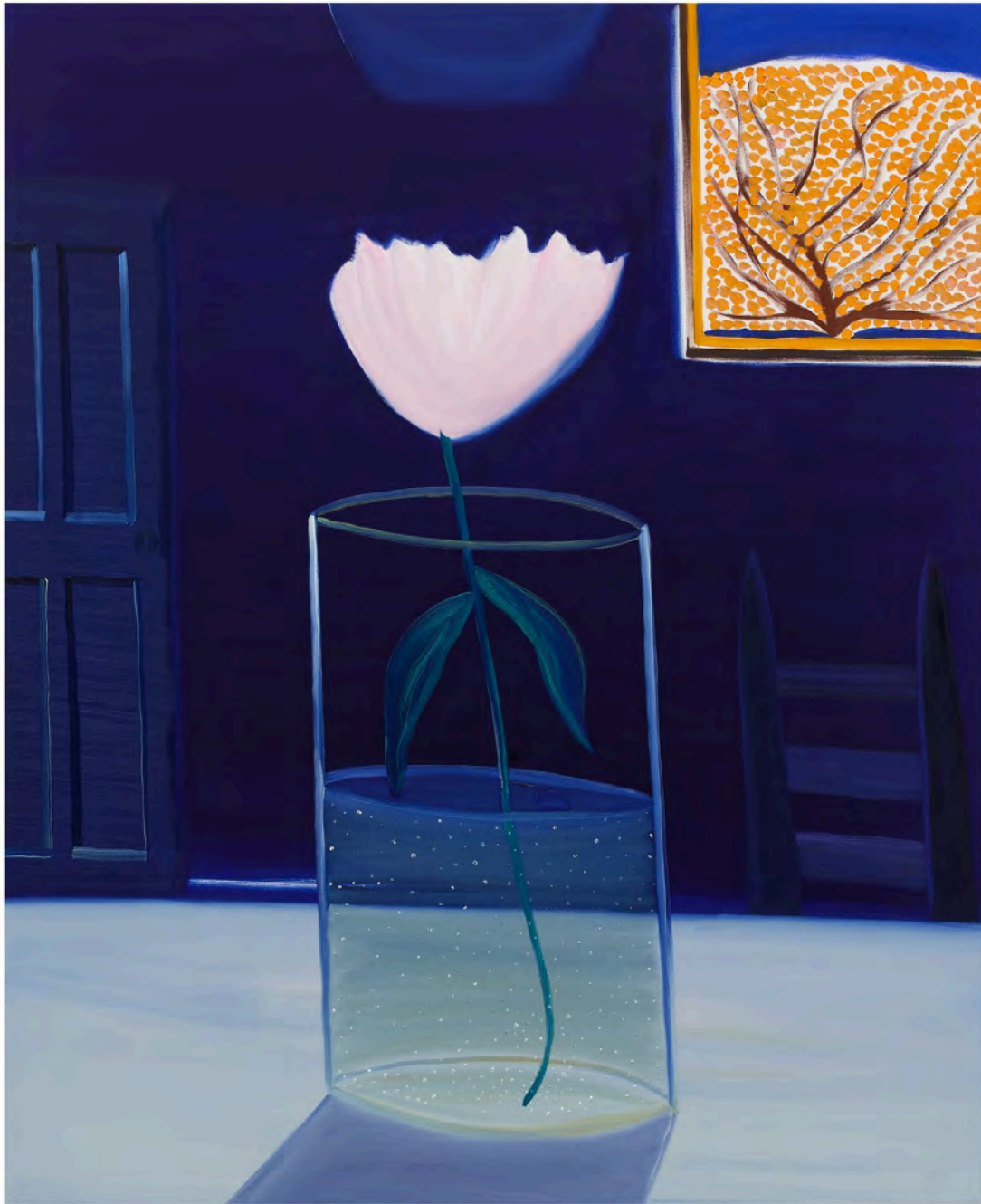
Matthew Wong, Blue Night (2018).