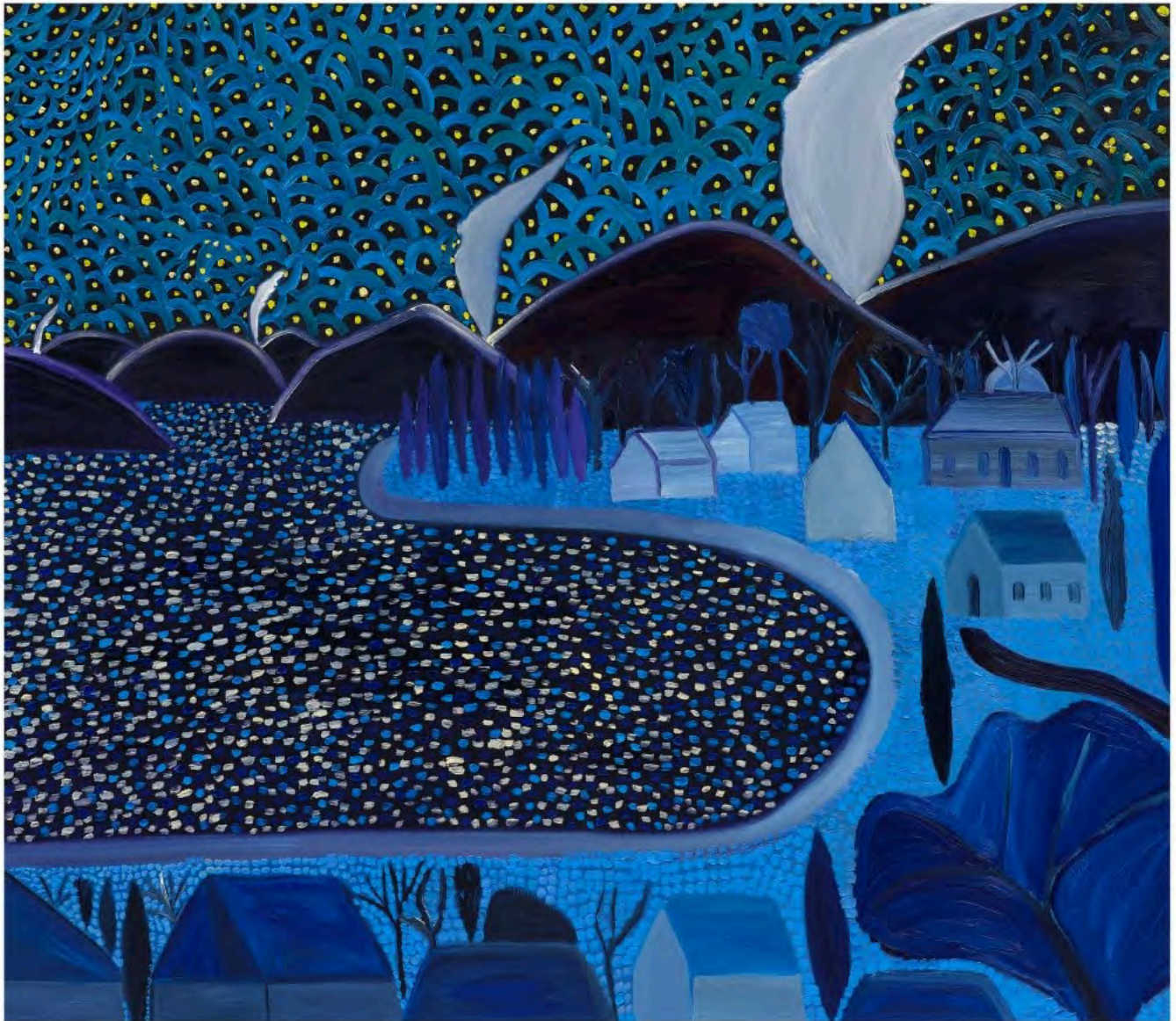
Matthew Wong, Starry Night (2019). © 2019 Matthew Wong Foundation/Artists Rights Society (ARS) New York. Image courtesy of The Matthew Wong Foundation.

The exhibition is on view at the Art Gallery of Ontario.