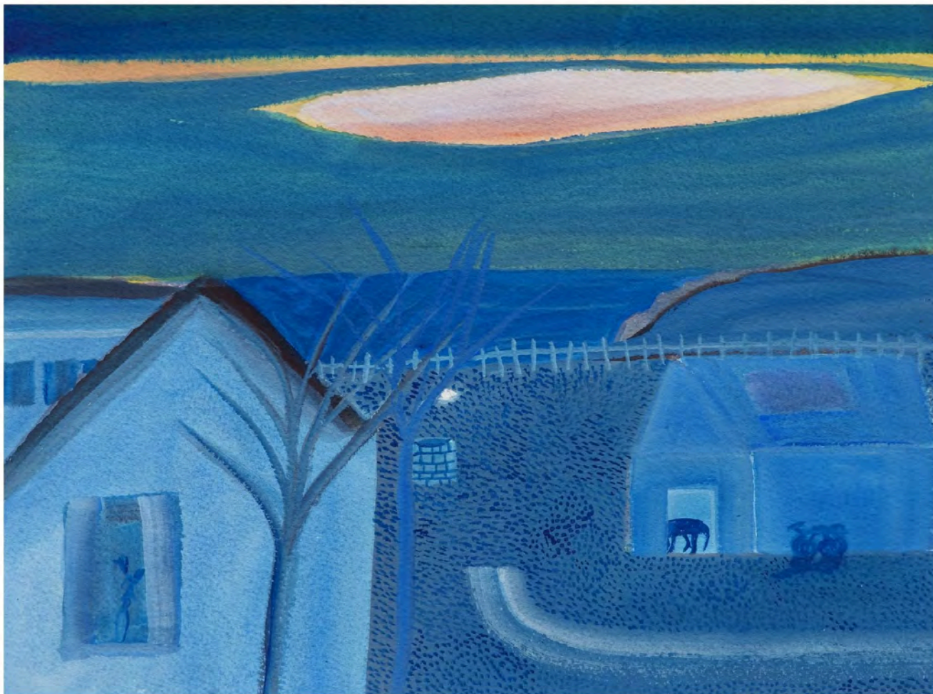
Matthew Wong, Untitled (2018). © 2019 Matthew Wong Foundation/Artists Rights Society (ARS) New York. Image courtesy of The Matthew Wong Foundation.