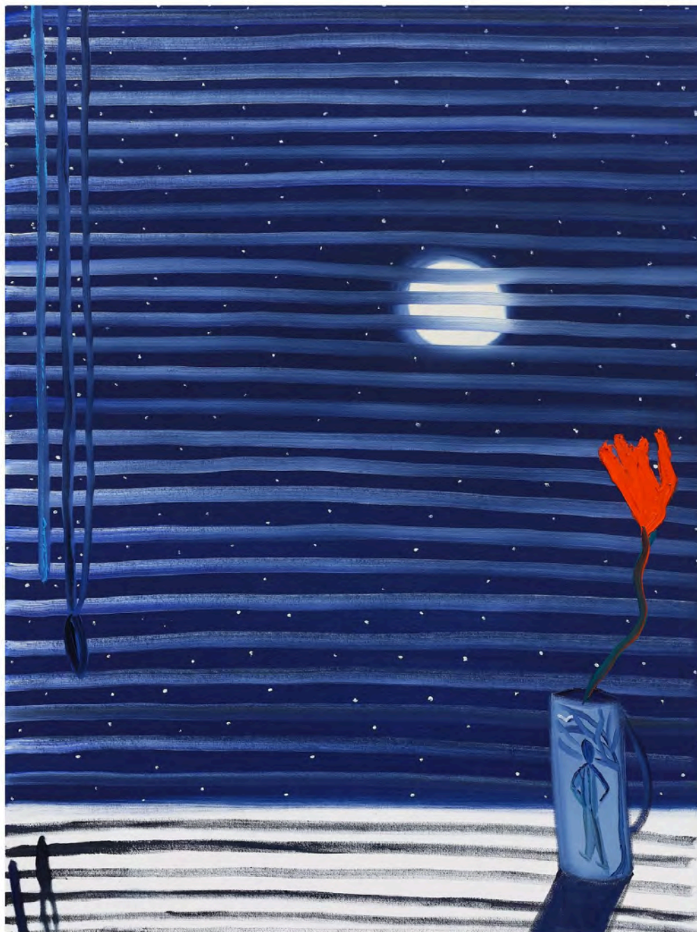
Matthew Wong, Meanwhile... (2018). © 2019 Matthew Wong Foundation/Artists Rights Society (ARS) New York.