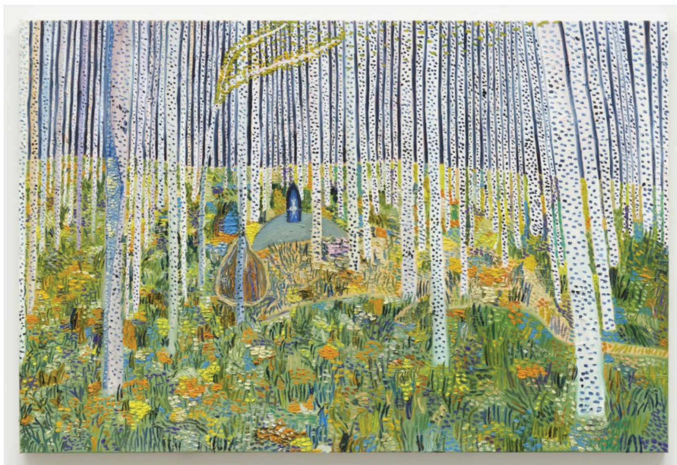
Matthew Wong, The Kingdom , 2017. © Matthew Wong Foundation c/o Pictoright Amsterdam 2023.

The Chinese-Canadian painter has been called “the modern day Van Gogh.”