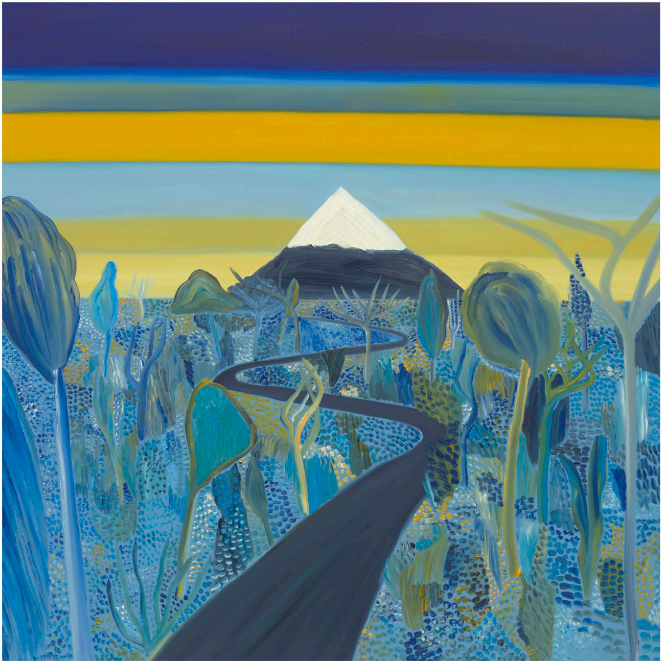
Matthew Wong, Unknown Pleasures , 2019, Museum of Modern Art, New York © 2023 Matthew Wong Foundation / Pictoright Amsterdam, 2023. Digital image courtesy of MoMA

“Matthew Wong | Vincent van Gogh: Painting as a Last Resort” will be on view at the Van Gogh Museum, Amsterdam, from March 1 to September 1, 2024.