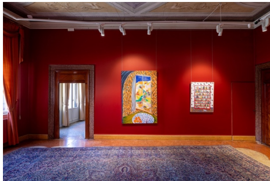
Installation view, “Matthew Wong: Interiors” at the Matthew Wong Foundation.