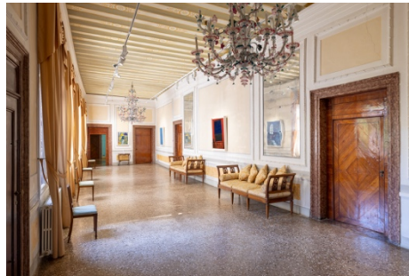
Installation view, "Matthew Wong: Interiors" at the Matthew Wong Foundation.

From the 61st International Art Exhibition of La Biennale di Venezia to the inaugural exhibition at the Matthew Wong Foundation