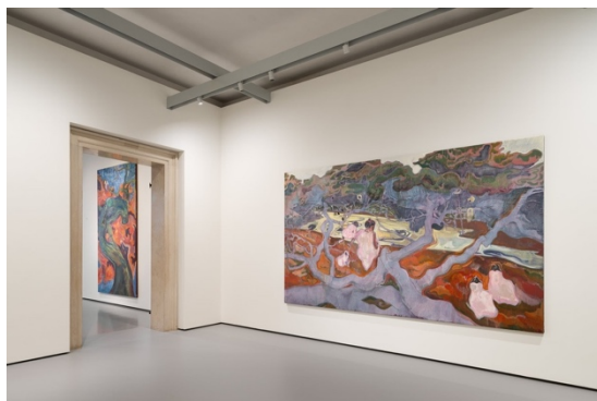
Installation view, “Michael Armitage. The Promise of Change, 2026,” at Palazzo Grassi, Venezia.