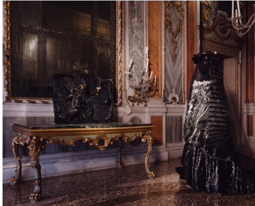
Christian Lacroix Haute Couture Fall/Winter 1997