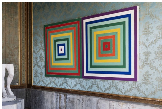
Frank Stella Scramble: Green Double/ Left N, Right 8, (1977).