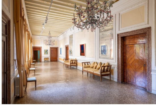
Installation view, “Matthew Wong: Interiors” at the Matthew Wong Foundation.