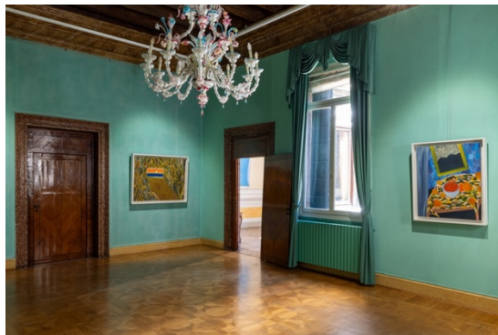
Installation view, “Matthew Wong: Interiors” at the Matthew Wong Foundation.

This spring, Marina Abramović becomes the only living female artist to receive a dedicated major exhibition at the Gallerie dell’Accademia . Debuting May 6, “Transforming Energy” weaves work by Abramović throughout the museum’s permanent collection, marking the first time the institution has integrated a temporary show within its historic galleries.