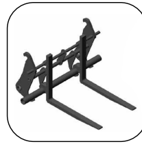
Forks Mounted on Quick Coupler