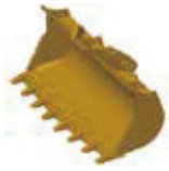
XCMG approved attachments