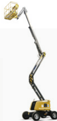
Aerial work platforms