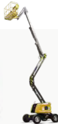
Aerial work platforms