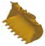
XCMG approved attachments