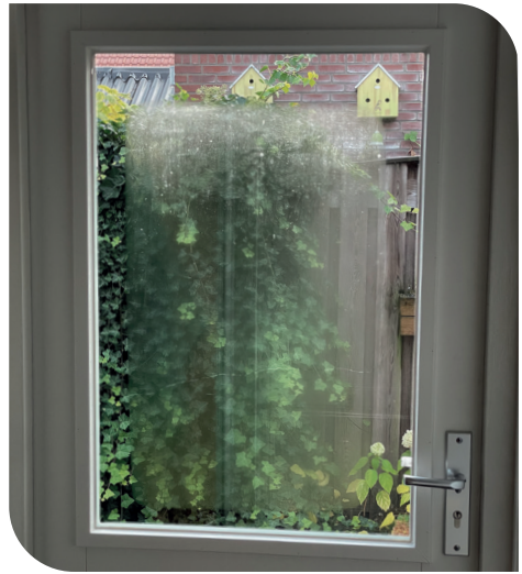
Condensation on the interior side of the glass.

Condensation on the interior side of the glass typically occurs at low outdoor temperatures and high relative humidity inside the home. The moisture in the air condenses on the glass surface. With insulating glazing that has a high insulating value, such as high-performance insulating double glazing, this risk is smaller than with glazing with poor insulating properties, like single glazing. This also depends on the specific situation. It's important to note that condensation on the inside is not a product defect. Condensation can be prevented by proper ventilation. If you are replacing your existing glazing, make sure to carefully consider ventilation options.