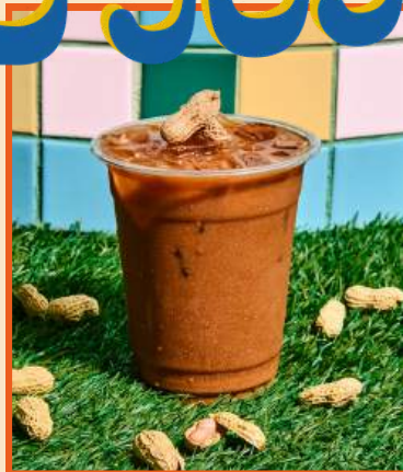
Nuts on the Beach