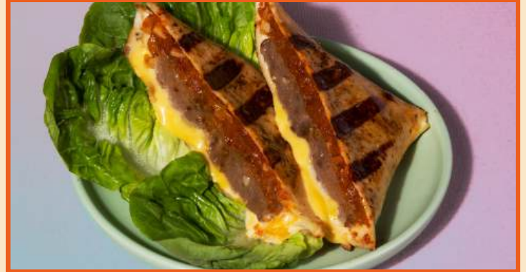
chicken & beef Juju bar...16.9

tender minced beef patty with chesse hugged in 100% chicken wrap with a touch of zesty tomato sauce