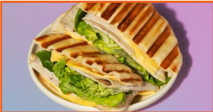
chicken pita cheese melt...18.9

enjoy the comfort of carbs with all the protein punch.