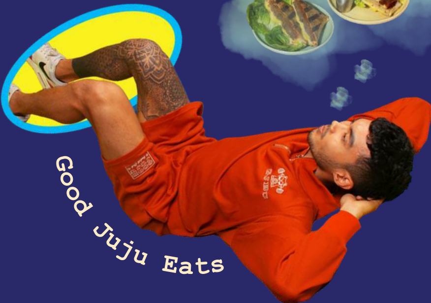
Good Juju Eats