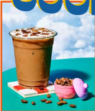
Bananas For You