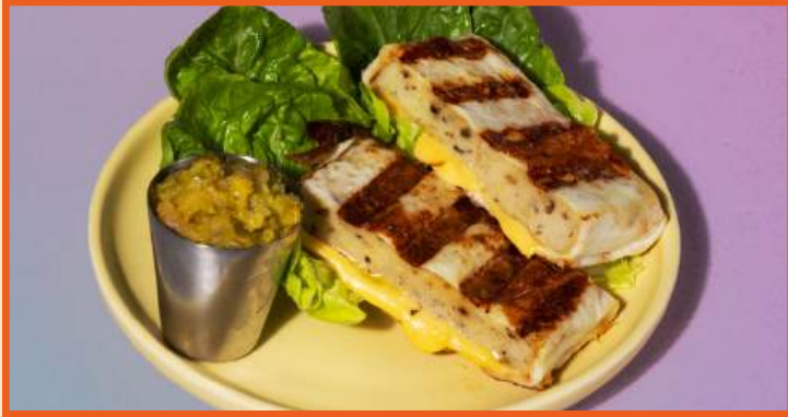
egg & chicken Juju bar....14.9

perfectly portioned, protein-packed bites on the go.