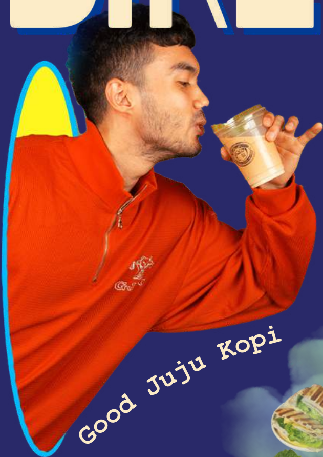
Good Juju Kopi