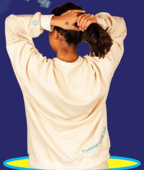
Good Juju Fix