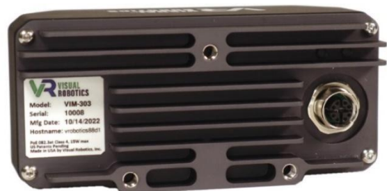
Rear View, showing mounting and M12 Ethernet