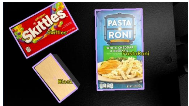
Sample Object Detection

VIM-303 incorporates seamlessly with the Universal Robots brand of robot arms. The included UR Cap adds vision guidance capability to the native PolyScope graphical programming environment. More complex functionality is possible using the XML-RPC API, allowing users to program in Python, C++ or Java. Users new to robotics can use our no-code programming method with QuickPick-303 using Blockly.