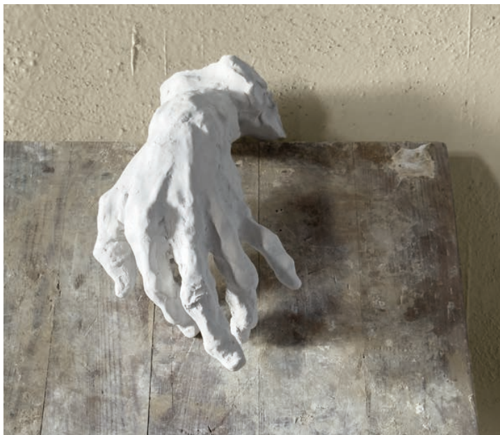
KLEKÁNICE II. NOONWRAITH II. 25 X 14 X 15 CM