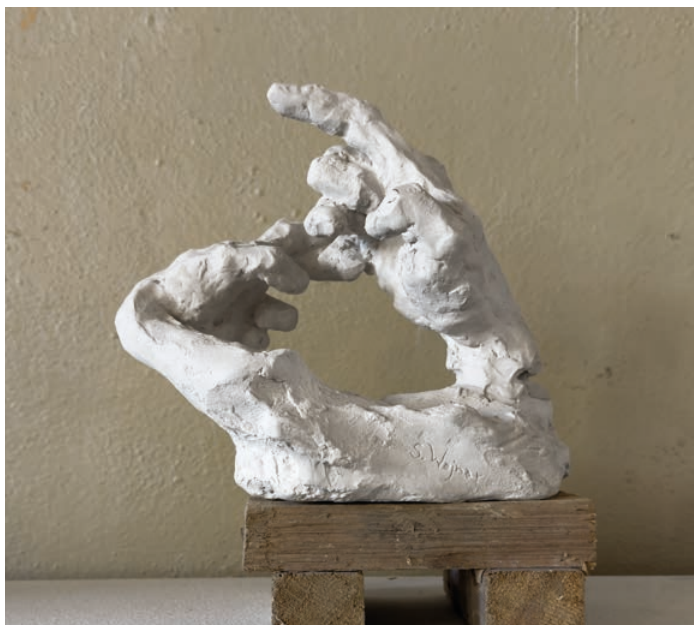
ŽIVOTNÍ BOJ LIFE STRUGGLE 19 X 20 X 12 CM