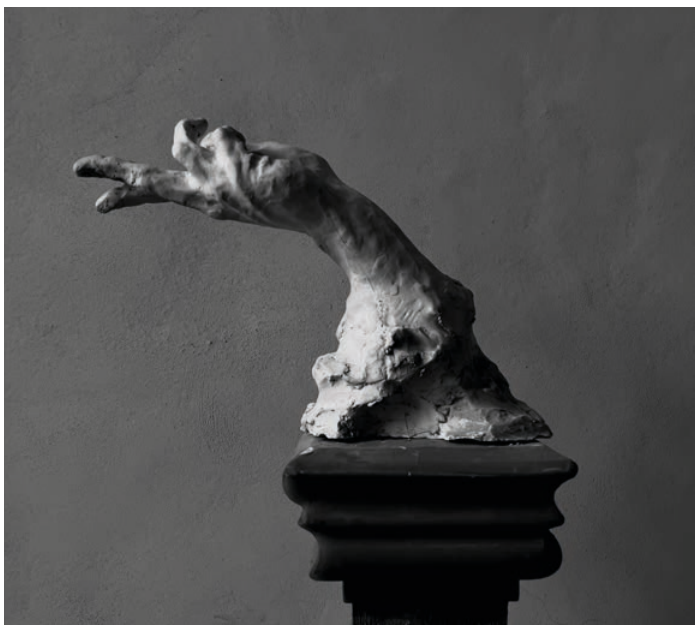
NABÍZÍM TI SVOU CESTU I OFFER YOU MY PATH 31 X 44 X 20 CM