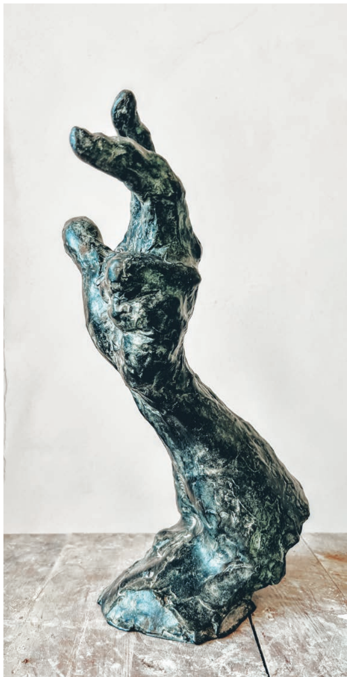
ŽEHNÁNÍ II. BLESSING II. 35 X 23 X 22 CM