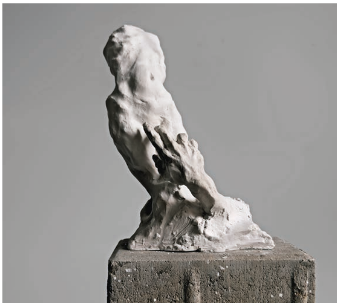
LETMÉ DOTYKY GENTLE TOUCHES 35 X 20 X 10 CM