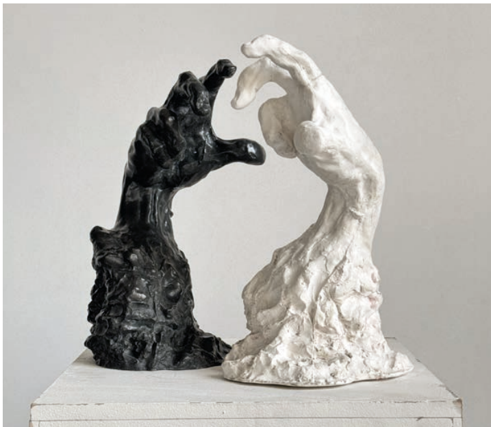
BEZMOC HELPLESSNESS 41 X 20 X 22 CM