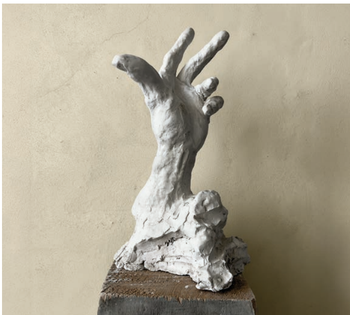
ŽEHNÁNÍ I. BLESSING I. 45 X 26 X 22 CM