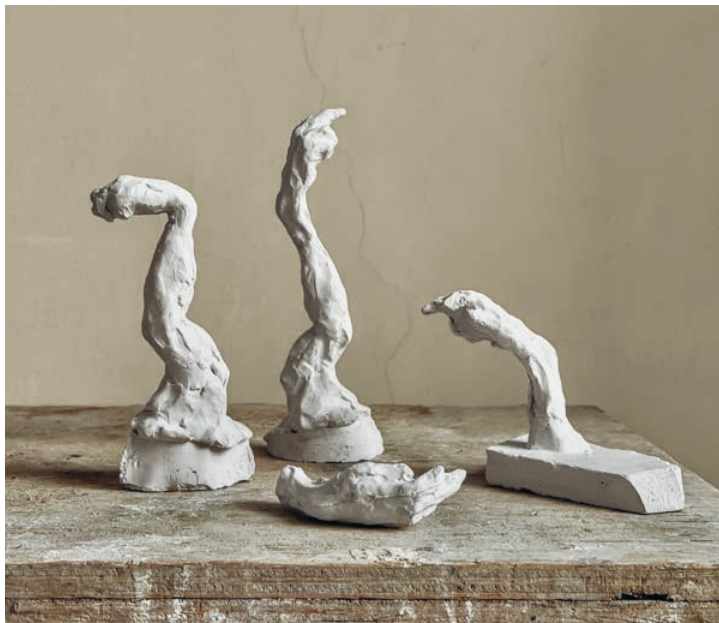
RUCE CHLAPCE Z NEMOCNICE HANDS OF A BOY FROM THE HOSPITAL