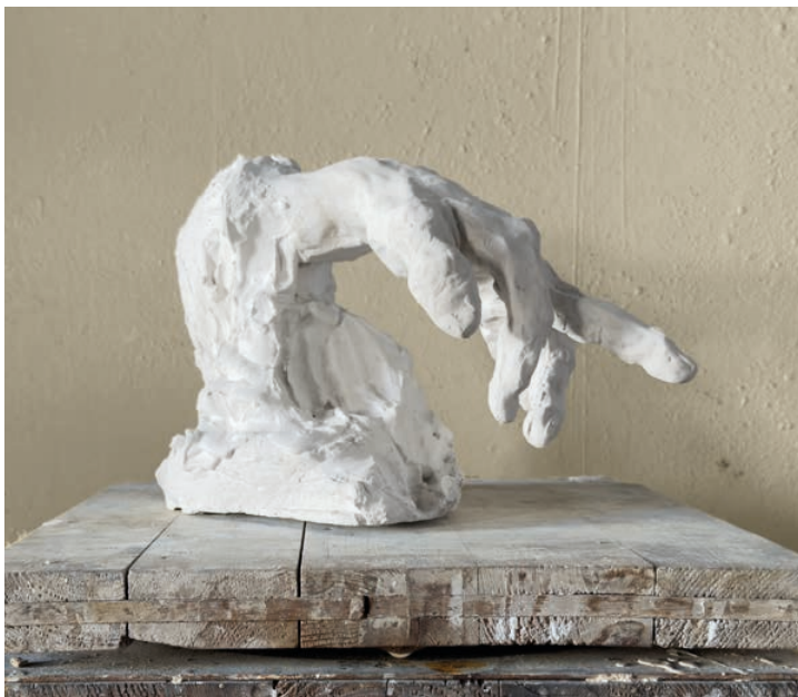
KLEKÁNICE I. NOONWRAITH I. 25 X 20 X 35 CM