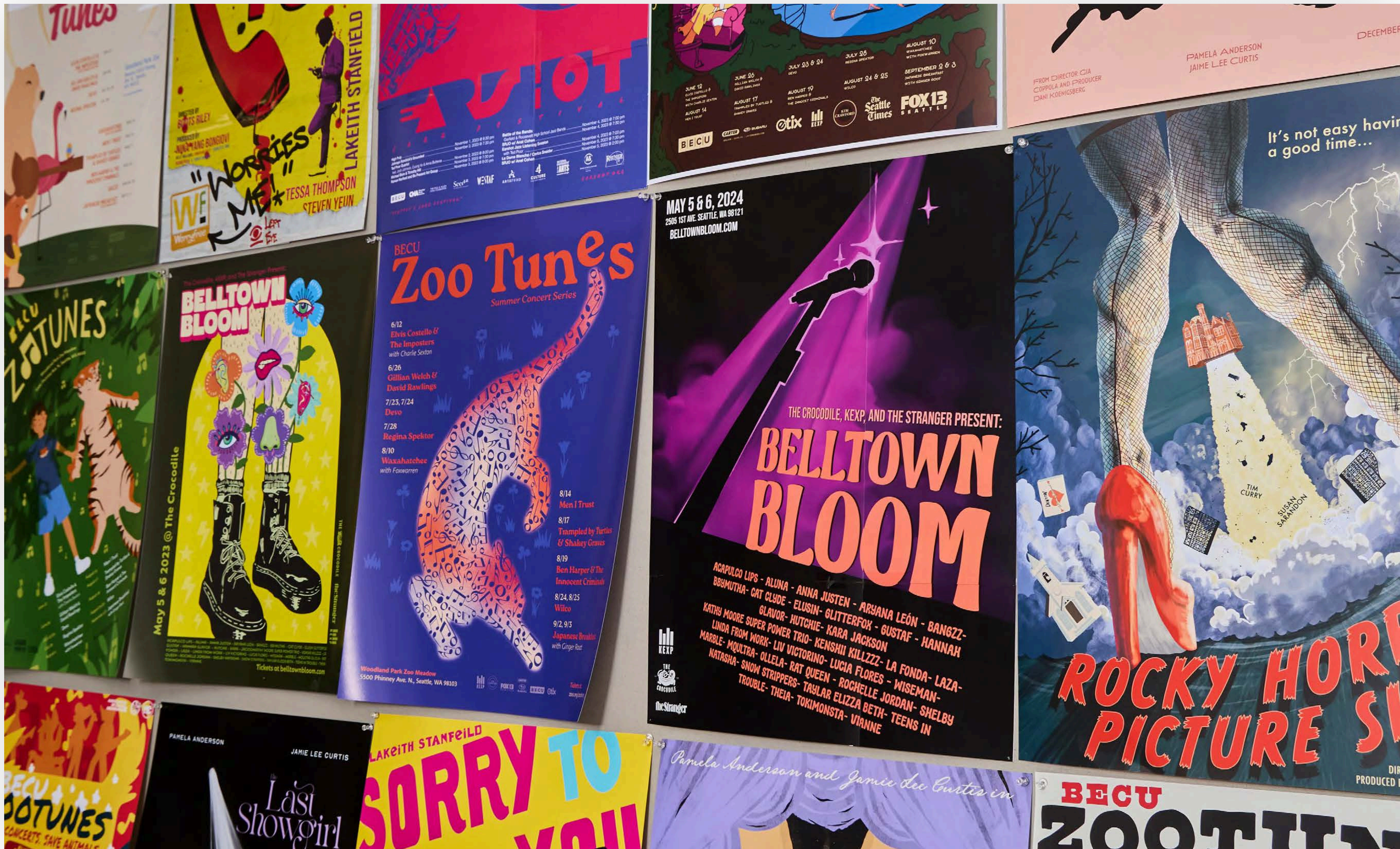
POSTER PROJECTS READY FOR CRITIQUE