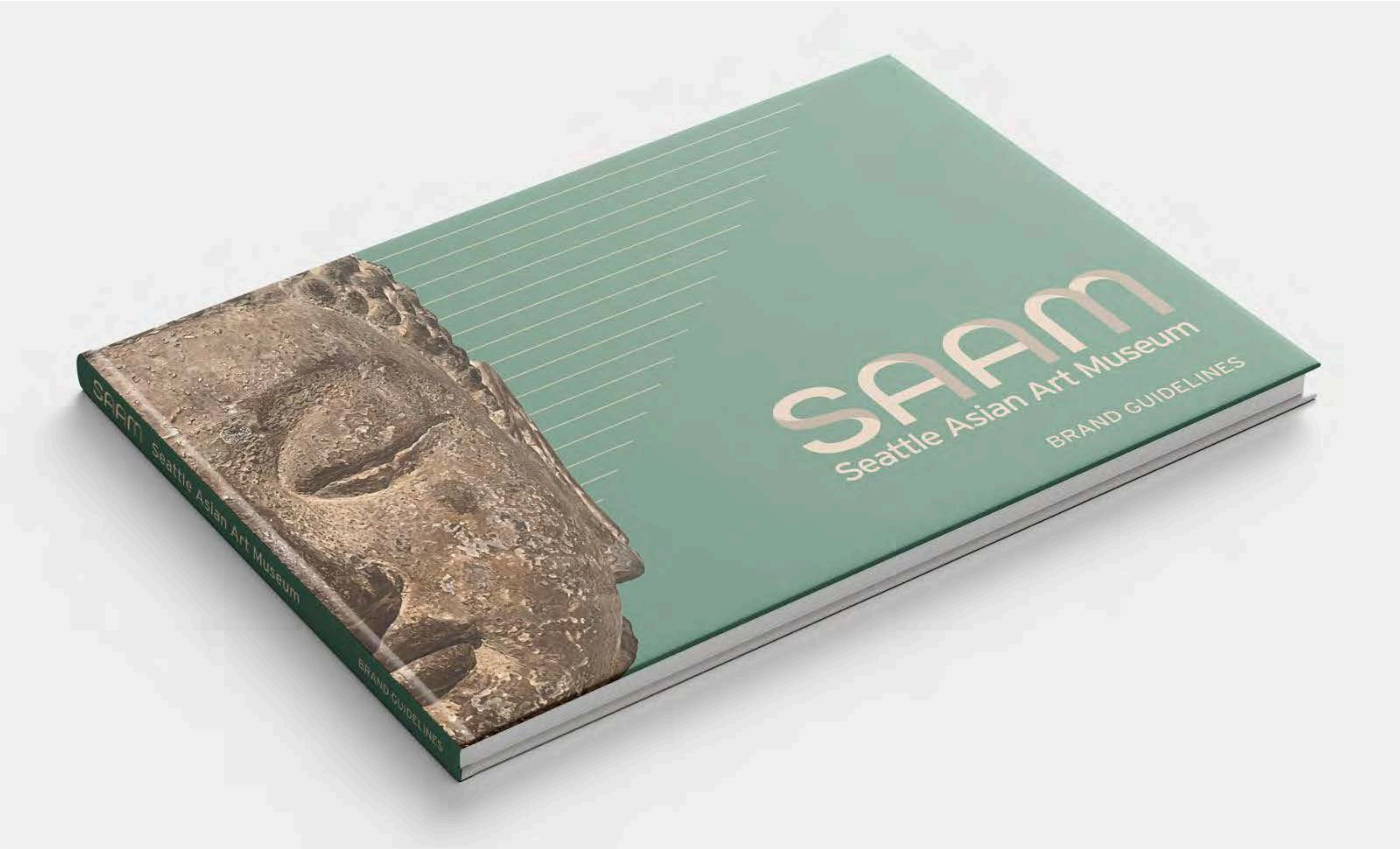
SEATTLE ASIAN ART MUSEUM REBRAND