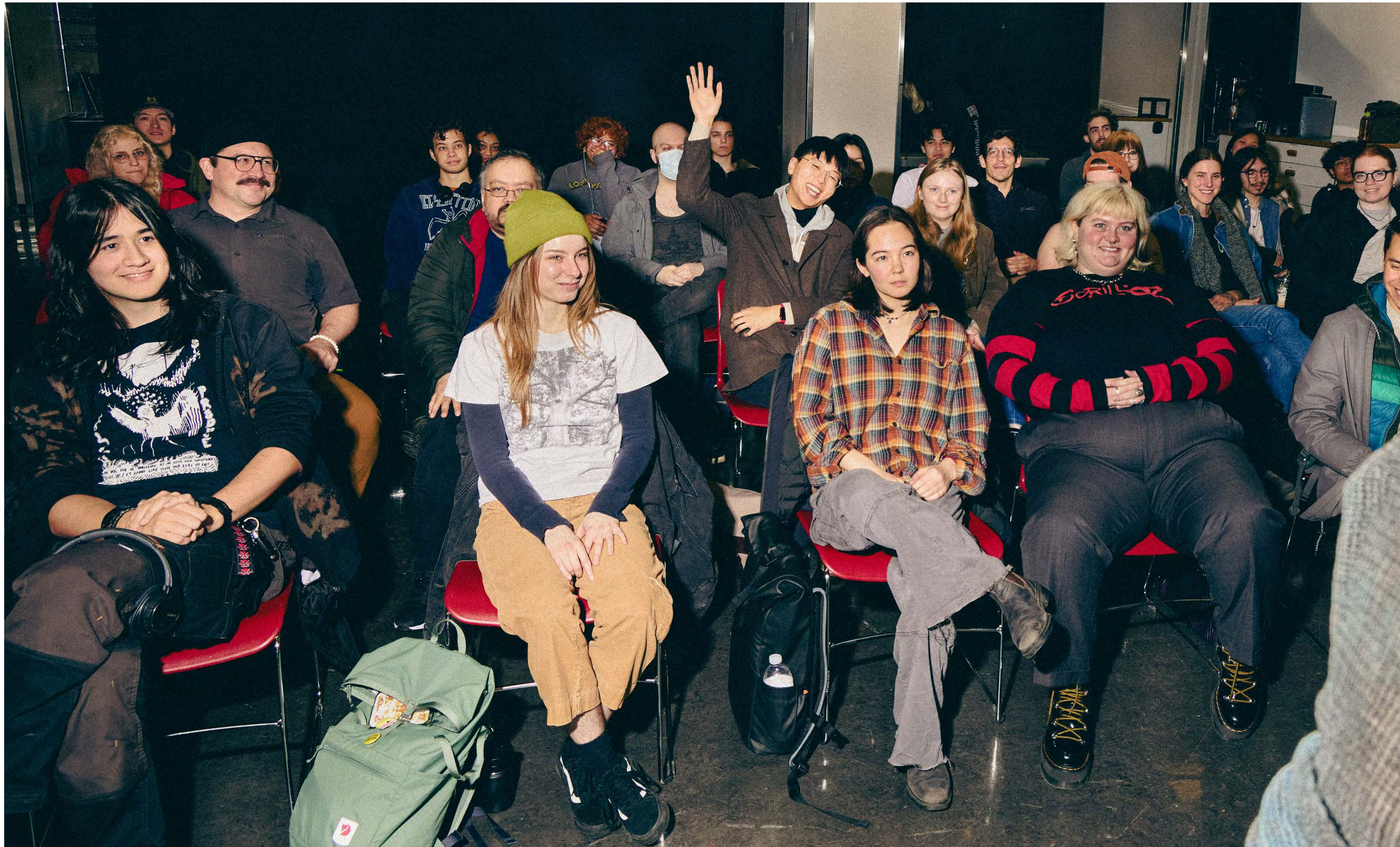
FUTURE CLASS OF 2026