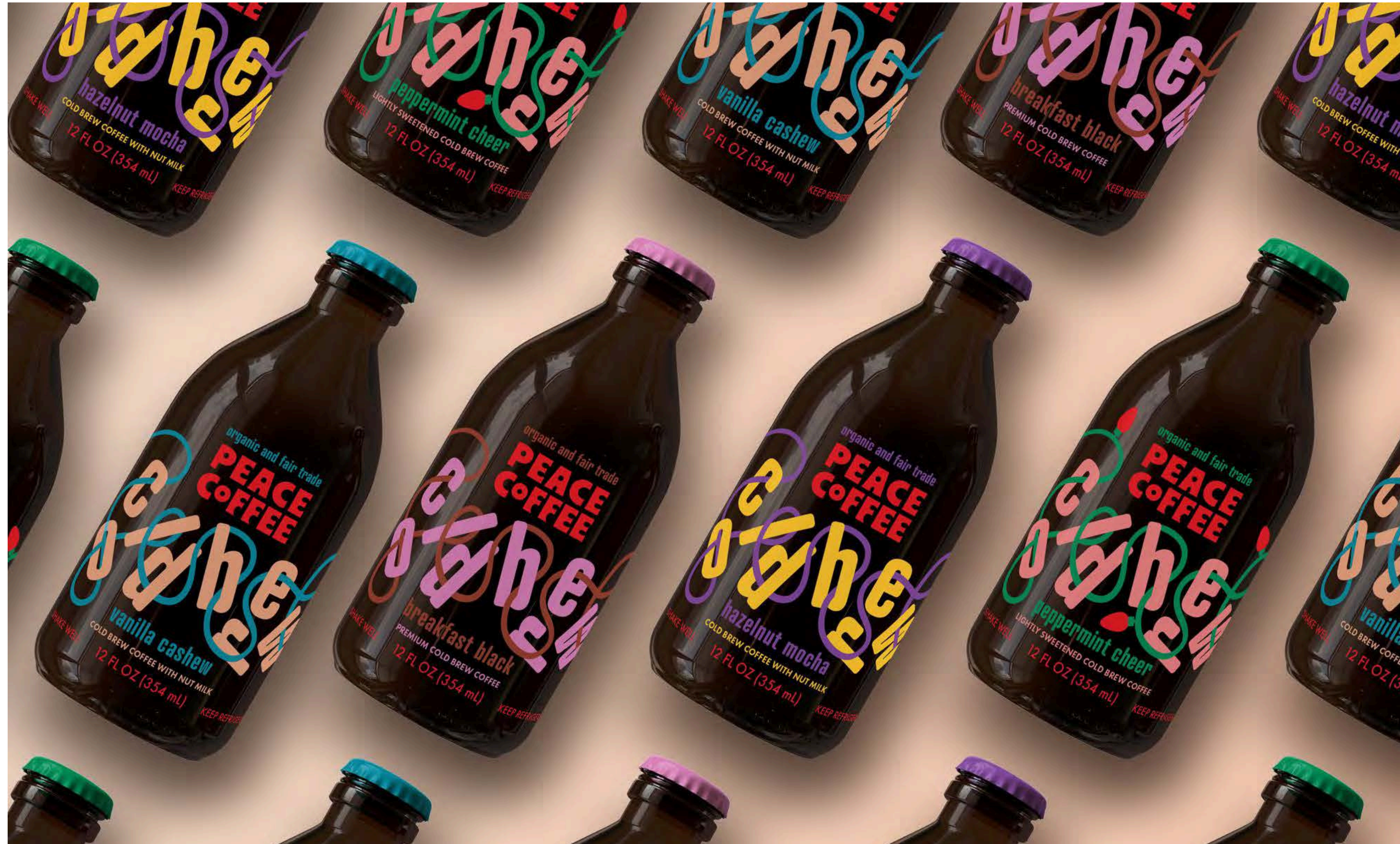
BOTTLE DESIGN MOCKUPS