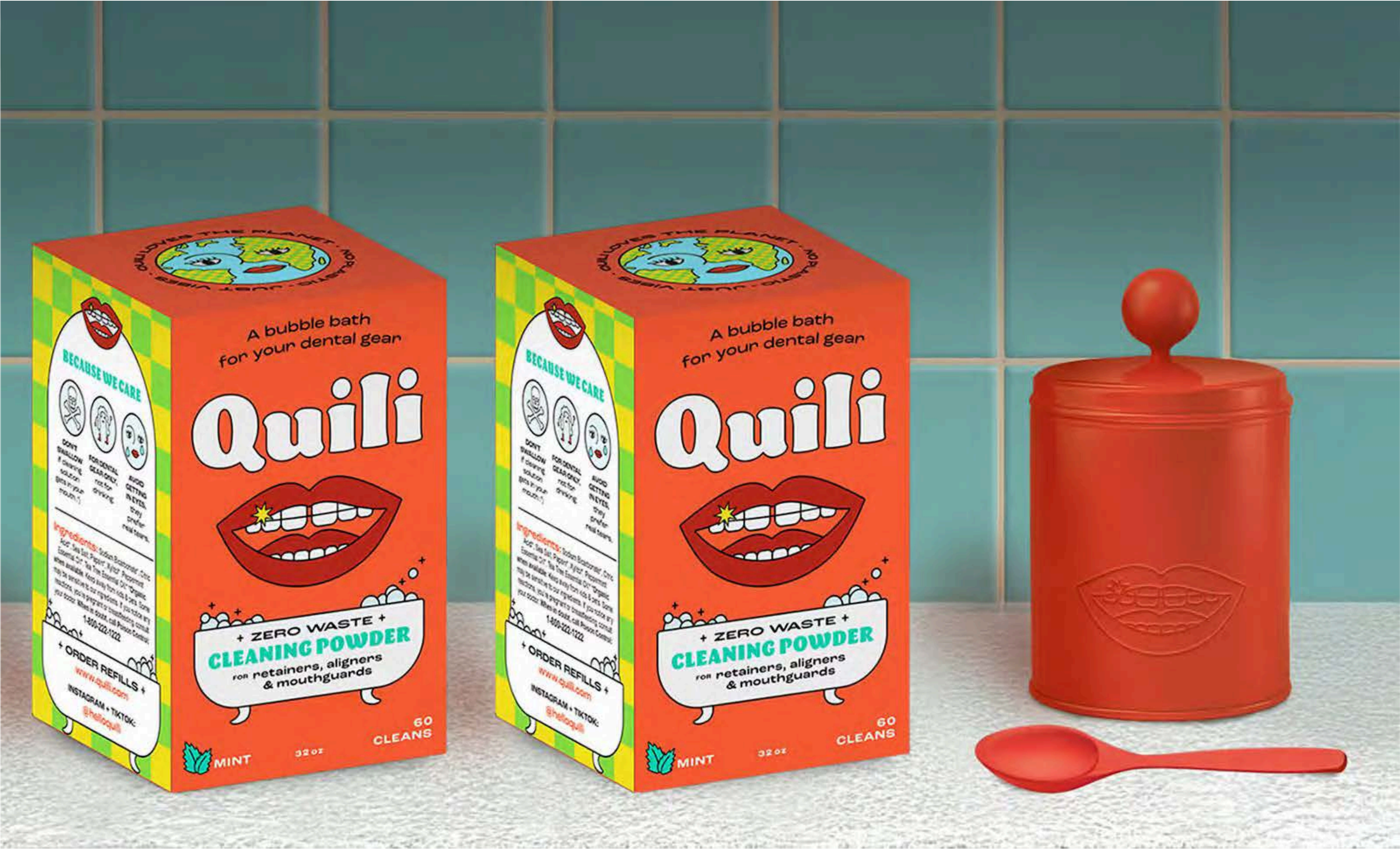
PACKAGING DESIGN MOCKUPS