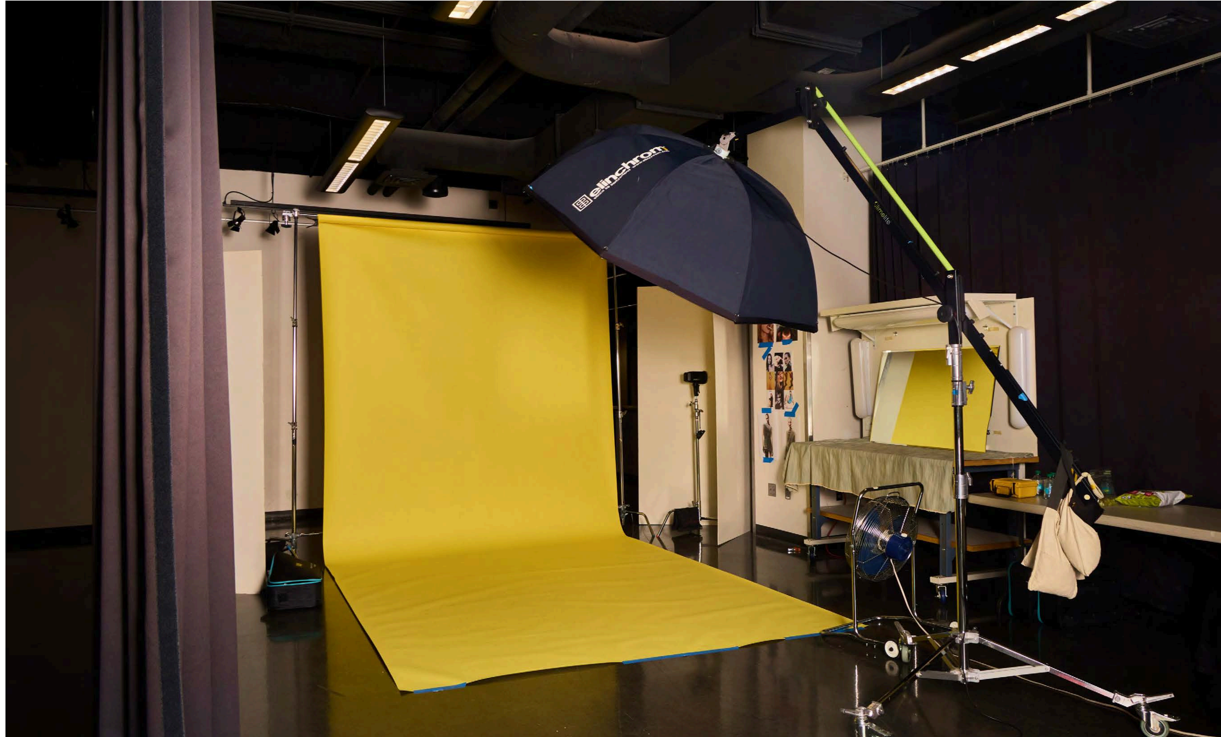
STUDENTS PREPARE A SET IN THE SCCA PHOTO STUDIO