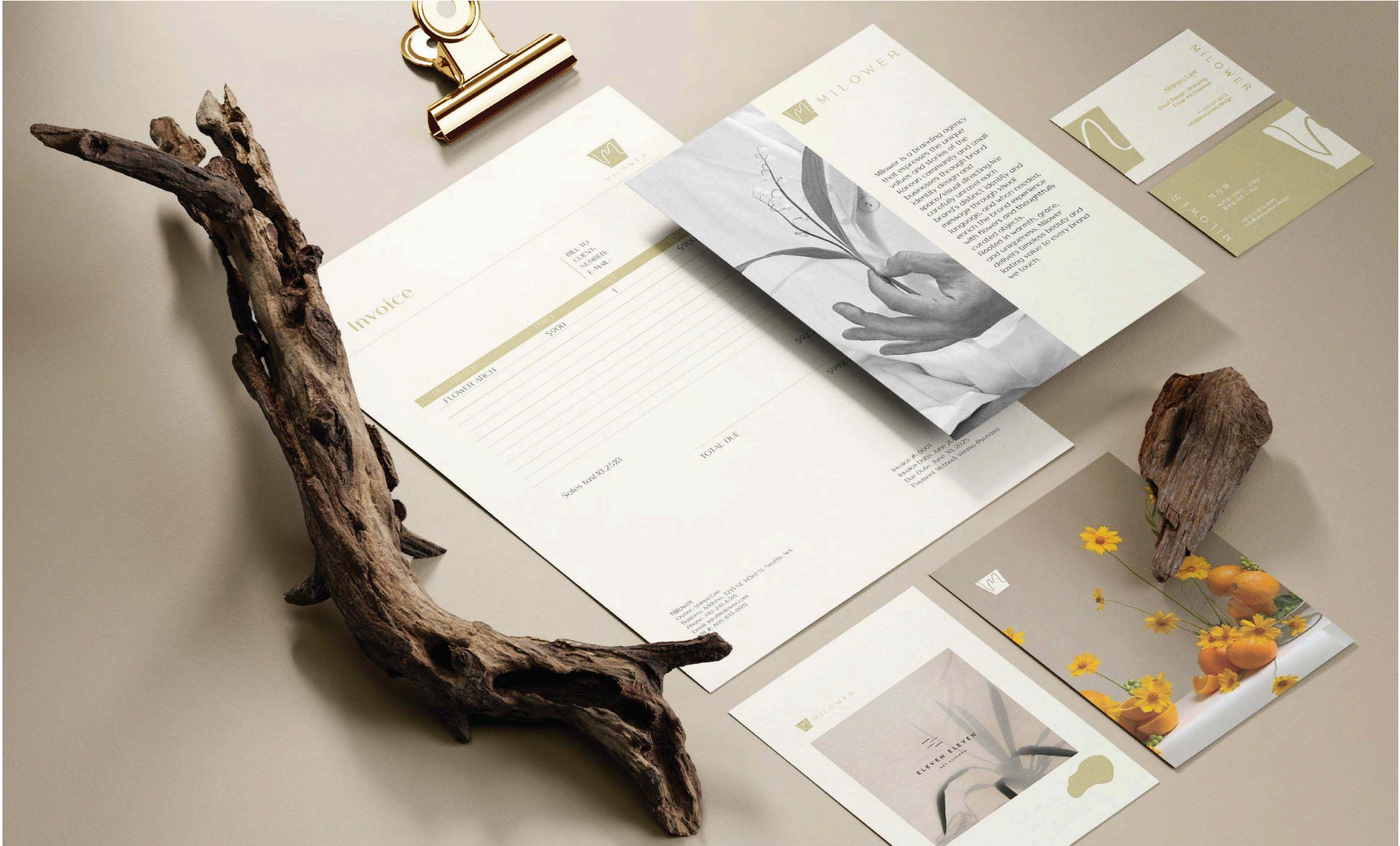
BRAND IDENTITY AND COLLATERAL