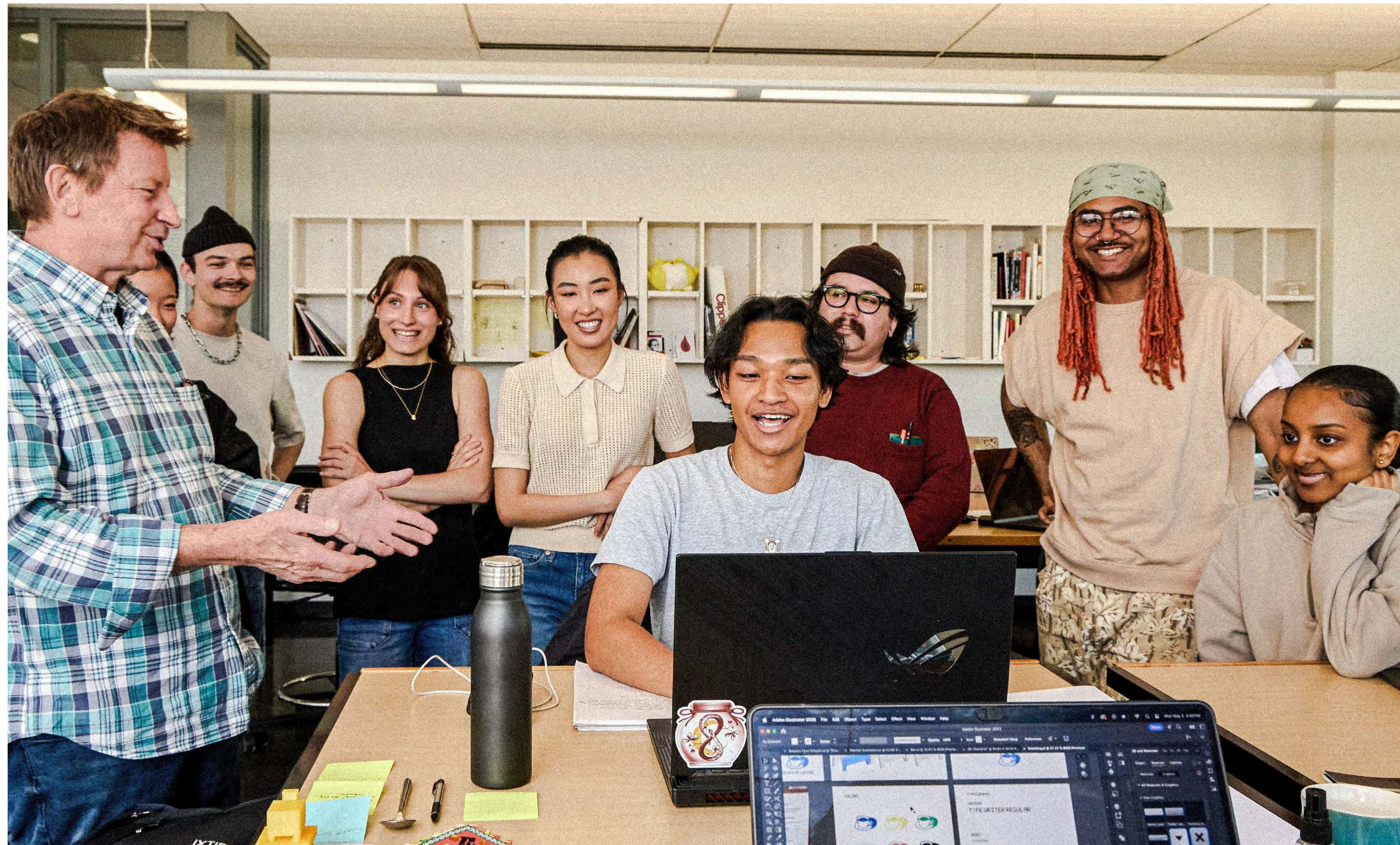
STUDENTS LEARN HOW TO PRESENT THEIR WORK & RECEIVE FEEDBACK