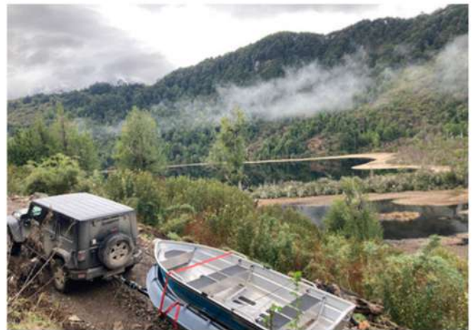
Exploring Secret Lakes