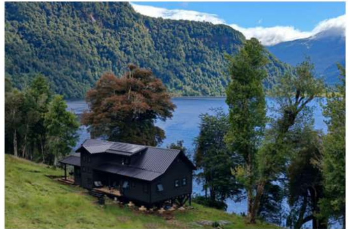
Private Lake House