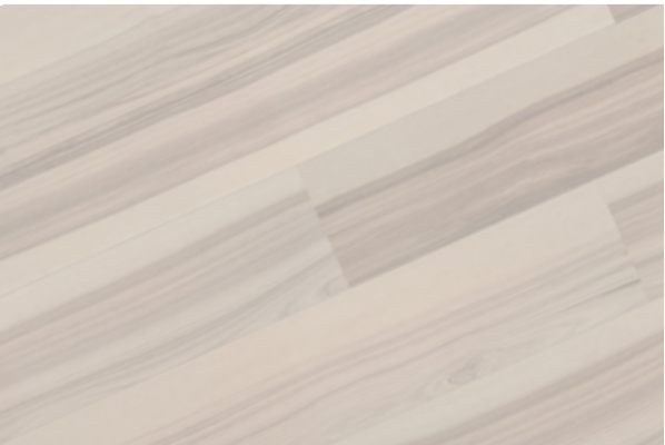
Ash White Stained (GVB136831)