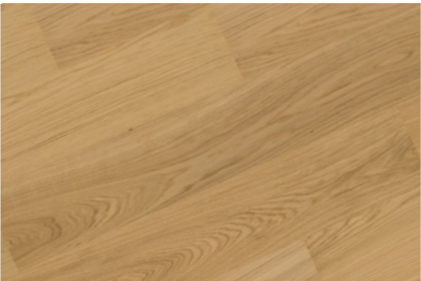
Oak Nature (GVB136842)