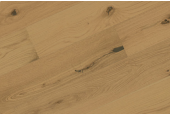
Oak Unique (GVB136841)