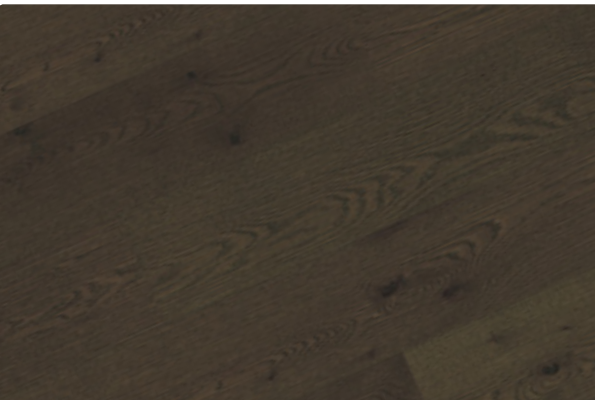
Oak Warm Black (GVB136847)