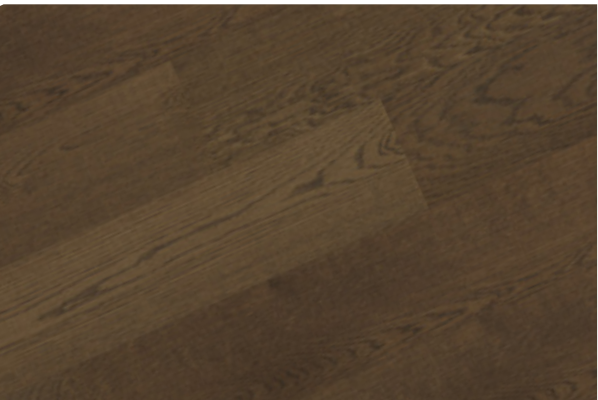
Oak Espresso (GVB136830)