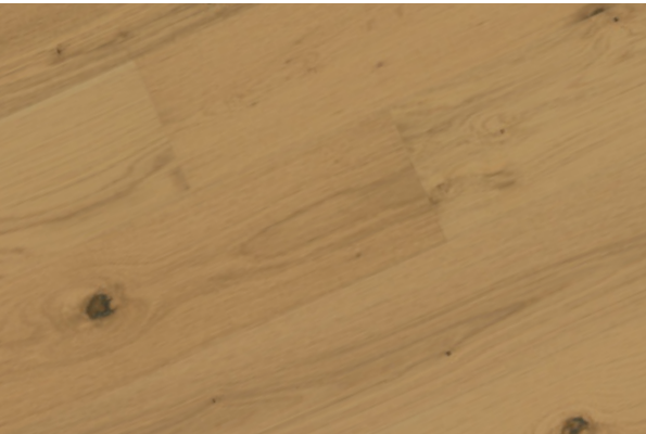
Oak Unique Oiled (GVB136851)