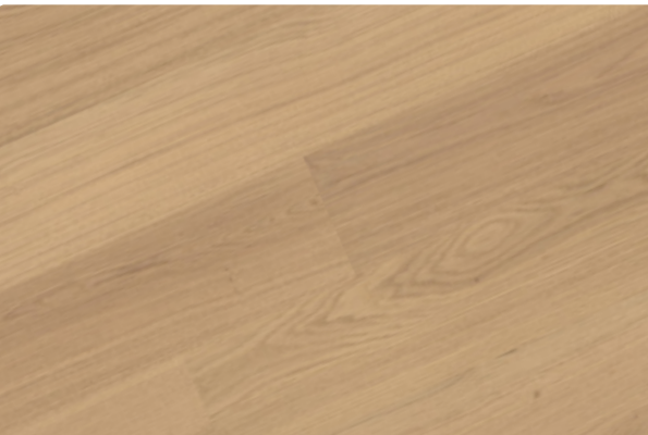
Oak Nature Raw (GVB136836)