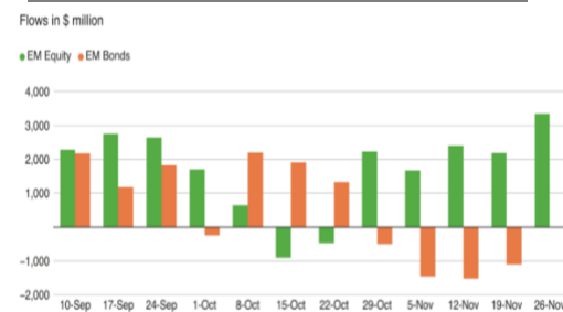
Chart 2. Fund Flows: EM Equities and Bonds