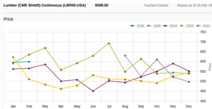
Figure 2. CME Lumber Futures (USD per Thousand Board Feet), Seasonal Comparison