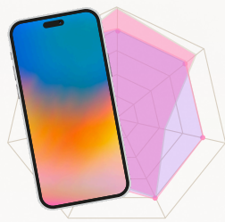
Product & QA Teams

Lumea uses Retrieval-Augmented Generation (RAG) to turn fragmented code, tickets, and documentation into a conversational expert that's always available.