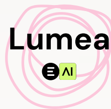
Exadel's Lumea AI Assistant