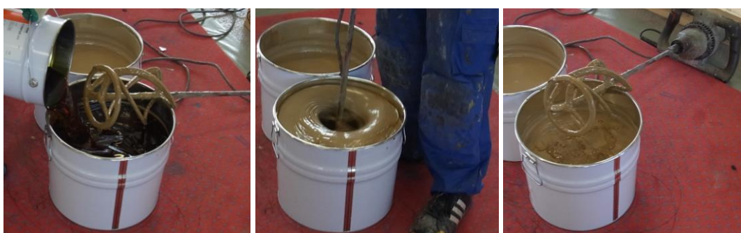
Mixing of the 2-component PU adhesive

Before installation mix both components of adhesive. Directly after mixing, pour all of the glue out evenly over the prepared installation area (approx. 0.7kg/m 2 if using SPORTEC 700 2K-PU adhesive ) so that none is left in the pot. Follow adhesive manufacturer's instructions if not using SPORTEC 700 2K-PU adhesive.