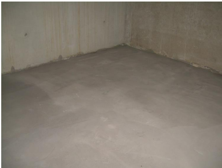
Even, suitable substrate made of poured screed

Depending on the substrate, it may be advisable to prime the substrate with a suitable (barrier-) primer.