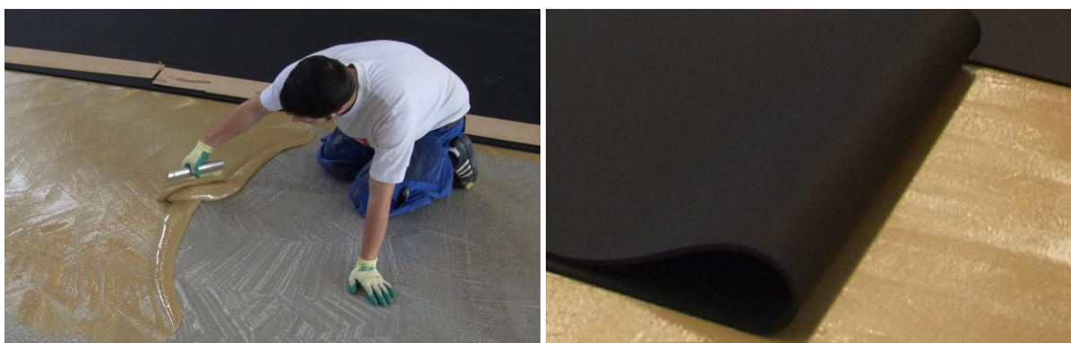
Adhesive application to clean substrate;

Apply the glue evenly with a notched trowel over the area where the SPORTEC® elastic layer will be rolled out. Use a notched trowel with a notch depth as recommended by the adhesive manufacturer to achieve the correct spread rate. After the glue is spread out correctly, roll the material out into the adhesive bed (please take note of different adhesives curing time).