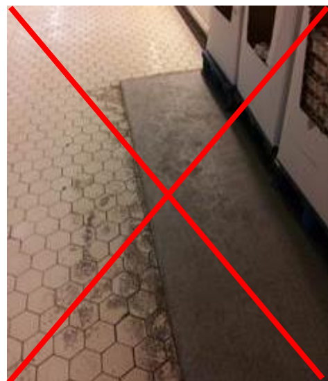
not suitable substrate