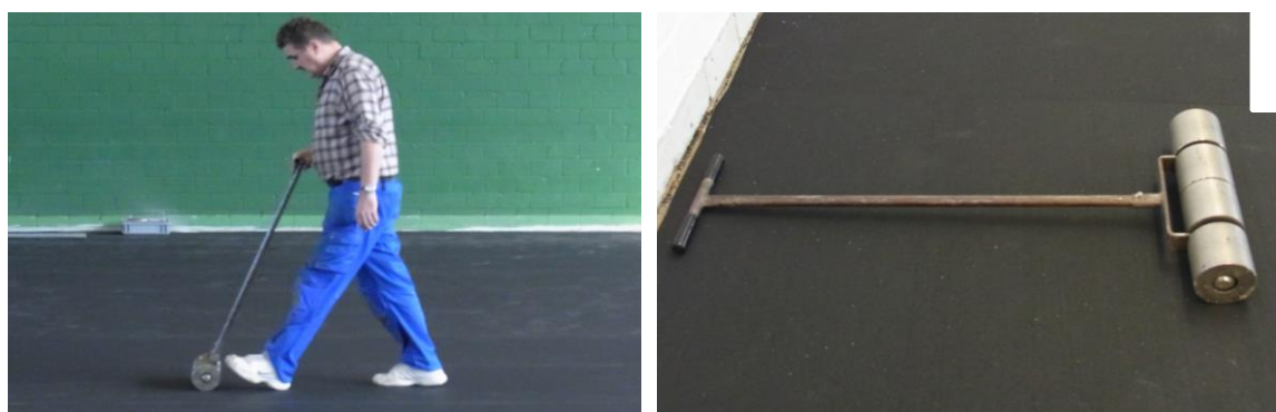
Scrolling of the floor with a pressure roller

After the adhesive has grabbed but before adhesive is fully cured, contact pressure should be applied to the surface with a roller to eliminate air bubbles underneath the material.