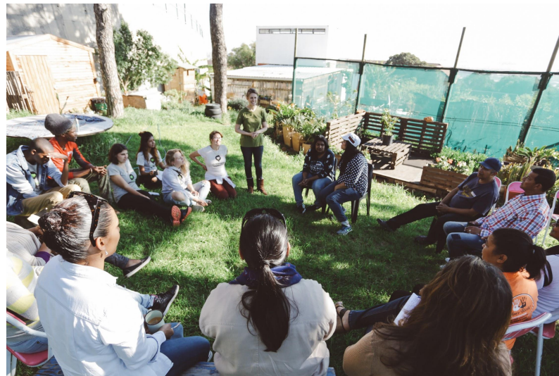
Teachers and ground staff at a tree care workshop in Cape Town.

By funding skills development workshops and improved monitoring and support programmes, you helped improve the survival rate of trees planted in Greenpop's Urban Greening Programme by 7%.