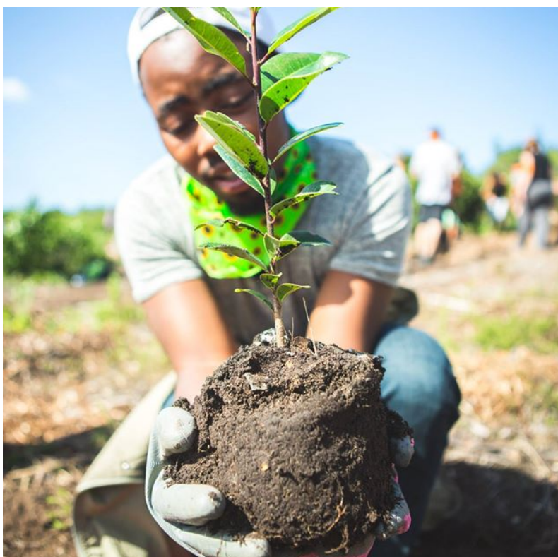
Indigenous tree being planted in the Platbos Reforestation Project.

These trees provide daily environmental and social benefits, play a critical role in rehabilitating indigenous forest ecosystems, and contribute to greening (and cooling) urban spaces.