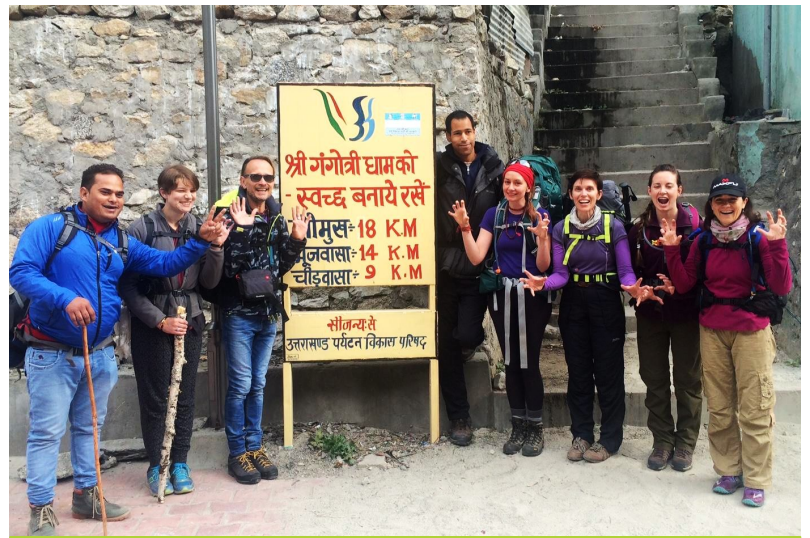
Trek for Trees team at the start of their Himalayan expedition.