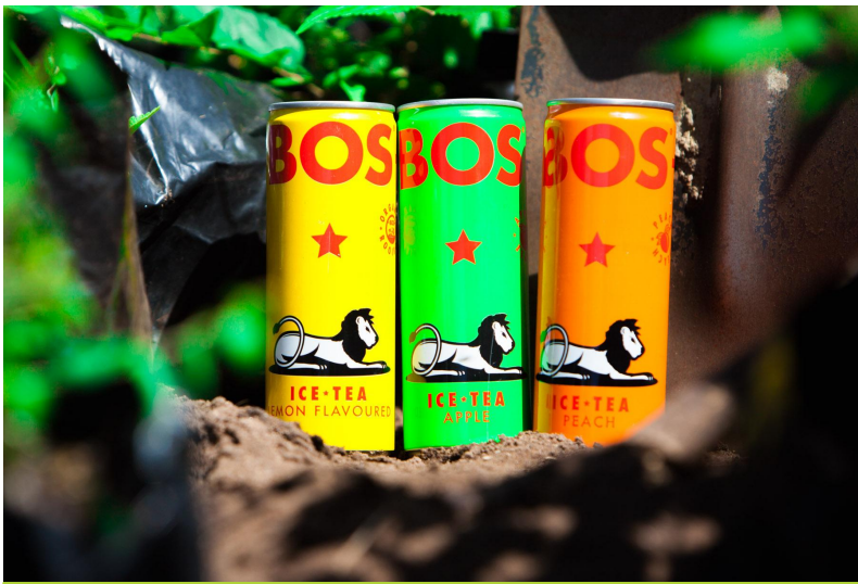
BOS Ice Tea has planted 14 505 trees since 2010.