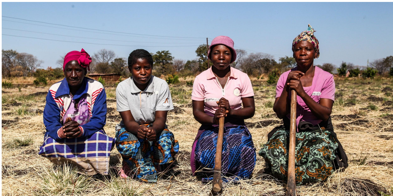
Female farmers at the Sons of Thunder Community Farm in Livingstone, Zambia.

In Livingstone, 67 community members directly benefited from training on permaculture at Sons of Thunder farming cooperative. An additional, 143 community members were upskilled through sustainability workshops focusing on asset based community development, farmer managed natural regeneration, bee-keeping, upcycling, environmentally sustainable building and eco-enterprise.