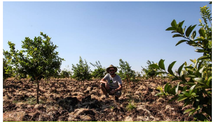
Fruit tree grove at Sons of Thunder Community Farm in Livingstone.