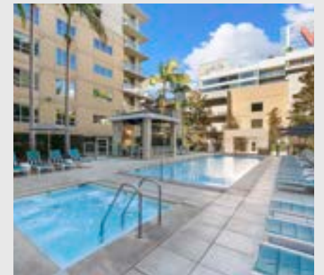
Heated Pool and Spa with Bordering Palm Trees