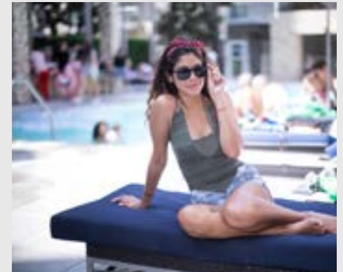
VIP Pool Parties