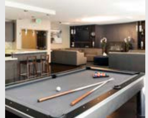
Resident Lounge with Billiards and Entertaining Kitchen