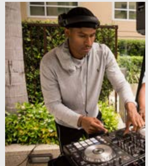
Signature 1600 VINE Events