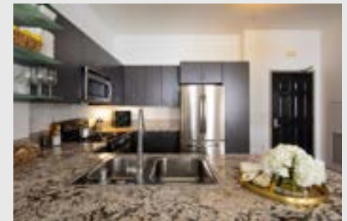
Natural Stone and Glass-Tile Finishes