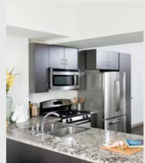
Stainless Steel Appliances & Fixtures