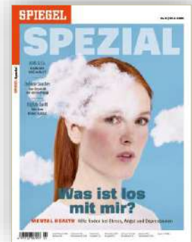
Cover: SPIEGEL SPEZIAL 2/2025

SPIEGEL SPEZIAL is published twice a year. The topic is determined during the first half of the year.