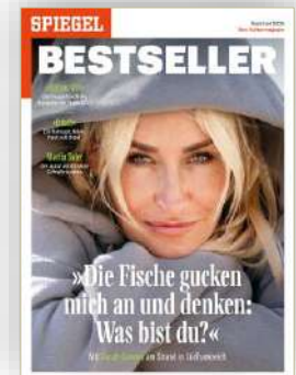
Cover: SPIEGEL BESTSELLER 2/2025

A central component of the magazine are bestseller lists from literature, film and Music - an incorruptible indicator of high audience and purchasing relevance!