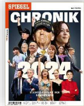
Cover: SPIEGEL CHRONIK 2024

The SPIEGEL CHRONIK is sent to SPIEGEL subscribers and also sold in shops, where it is displayed for four to six weeks.