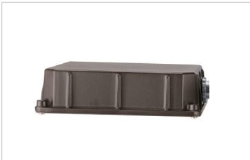
Emergency Battery Backup