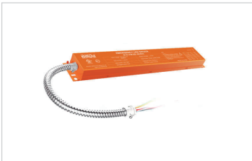
Emergency Backup Battery