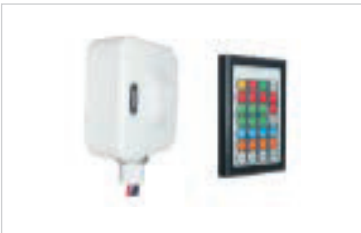
Occupancy Motion Sensor