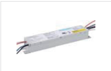
Emergency Backup Battery