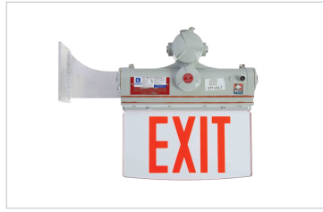
End Bracket Mount