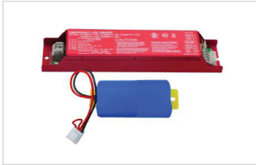
Emergency Backup Battery