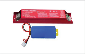
Emergency Backup Battery