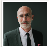
Arthur C. Brooks