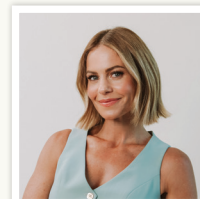
Candace Cameron Bure