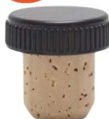
PLASTIC BAR TOP