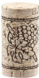
TWIN - TOP AGGLOMERATED