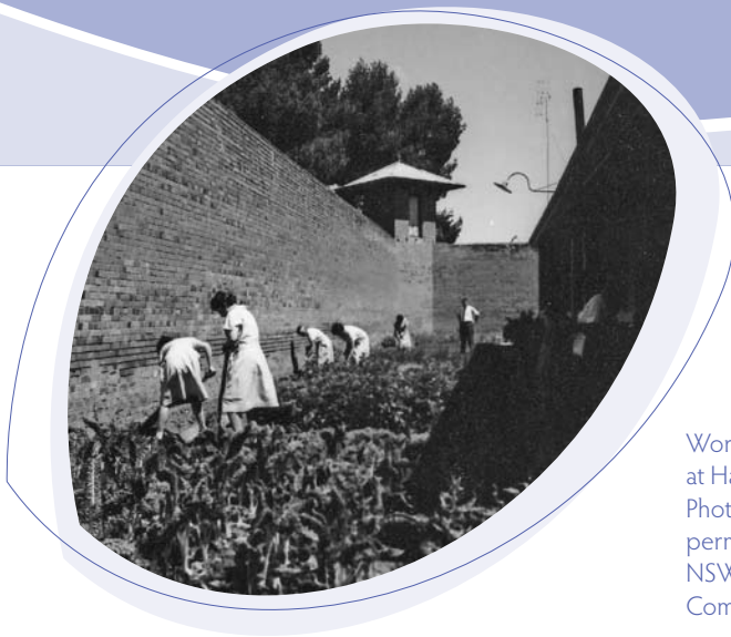
Working in the garden at Hay detention centre.