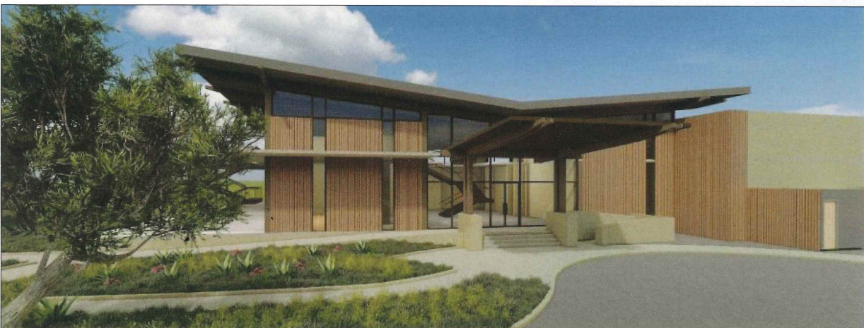
Rendering of the entrance to new main clubhouse for the Coronado Yacht Club. Rendering courtesy of the Coronado Yacht Club

FOUNDED: 1913 HEADQUARTERS: Coronado COMMODORE: Ken Wilson BUSINESS: boating MEMBERS: 650 WEBSITE: www.coronadoyc.org CONTACT: 619-435-0522 NOTABLE: The Coronado Yacht Club started in a leased wing of the Hotel del Coronado Boat House