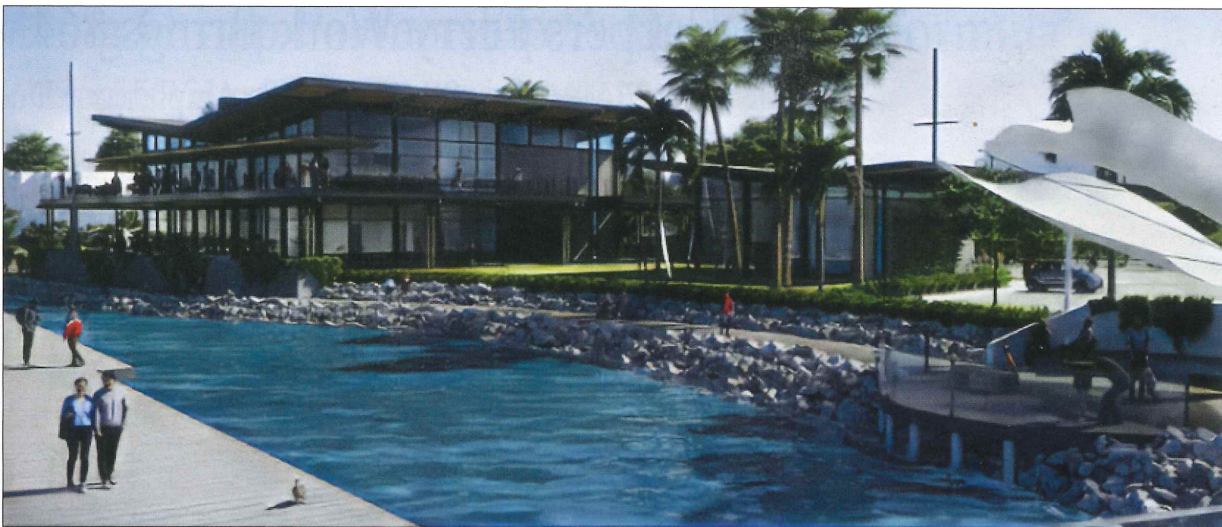
Plans are in the works to build a new home for the Coronado Yacht Club. Rendering courtesy of the Coronado Yacht Club