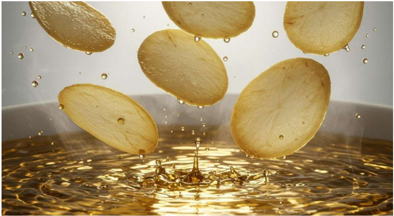
ACTUAL SIZE AND TEXTURE