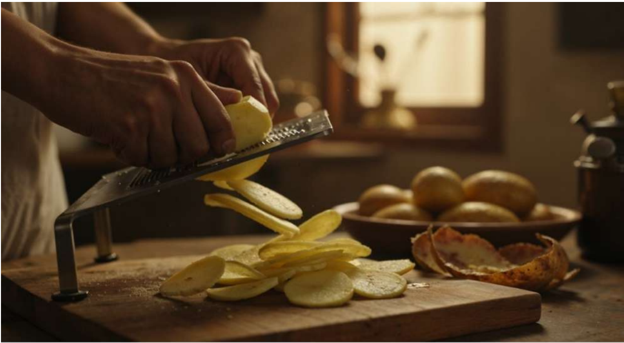
ACTUAL CHIP SHAPE