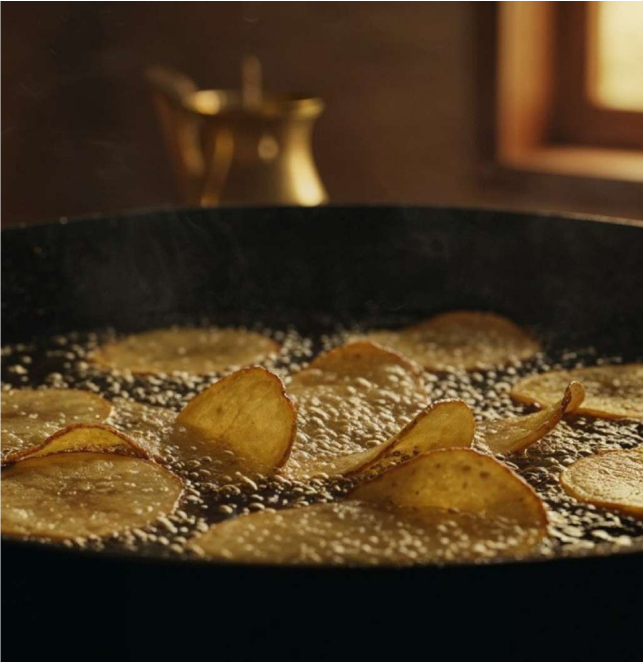
SPECIFIC OIL CONSISTENCY

We took all this, and fed it into a LoRA to create a world that is authentic to the client, and not randomly generated by AI