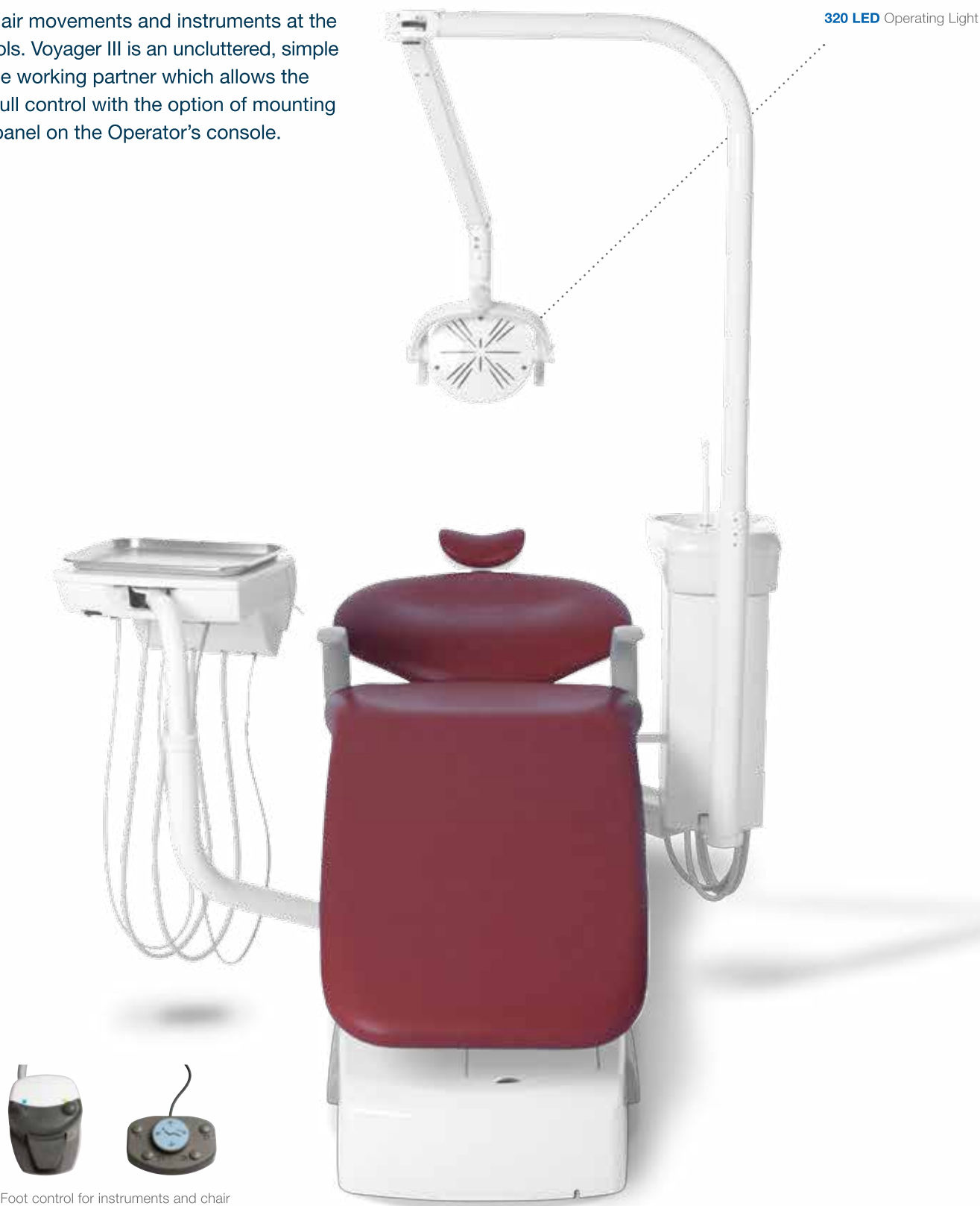
320 LED Operating Light

Control chair movements and instruments at the foot-controls. Voyager III is an uncluttered, simple and reliable working partner which allows the Operator full control with the option of mounting a control panel on the Operator's console.