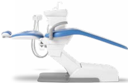
Voyager III 'SP' ambidextrous chair and cuspidor

Operator's control panel offers two presets, Last-Position Memory, Auto-Return and manual control for chair movements (optional)