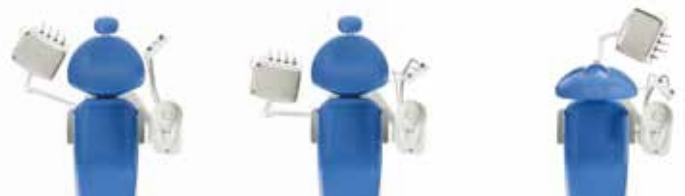
Compact, versatile delivery system offers useful working positions all the way around

Intelligently designed for a comfortable and compact, easy-clean working environment.