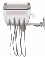
Voyager 'M' Module