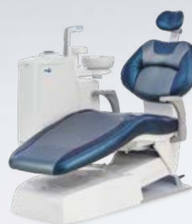
Left handed set up

Where space and ergonomics are important, the freedom and extra mobility this combination gives some practices is paramount.