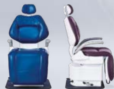
Eurus Swivel Chair Pages 26-27