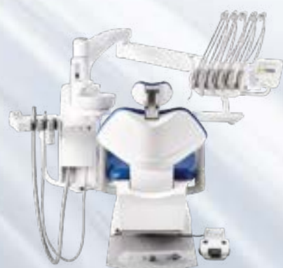
Eurus S1 Continental Rod Type Pages 16-19