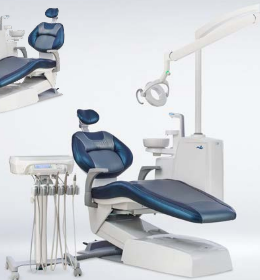
Right handed set up