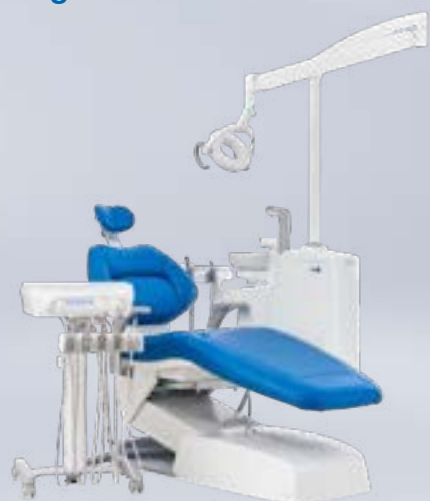
Eurus 'Flexible System' Pages 20-23