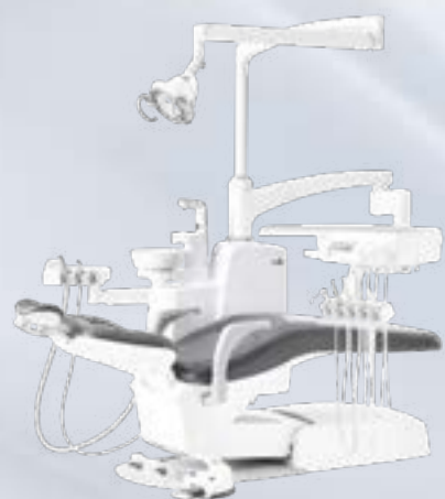
Eurus S1 Holder Type Pages 06-15

Comprising the Eurus S1 Holder Type, the Eurus S1 Continental Rod Type, and the Eurus Swivel Chair, each combines style with practicality. Innovative design features include a powerful, intuitive touch-screen, integrated chair foot controls and flexible lighting, all designed to maximise control, convenience and hygiene.