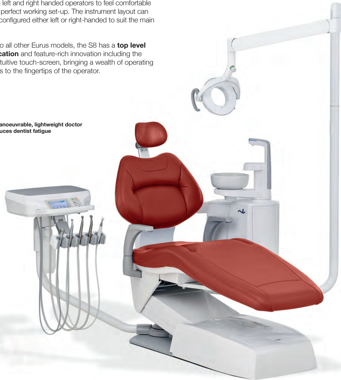
Eurus S8 holder type

Highly manoeuvrable, lightweight doctor table reduces dentist fatigue