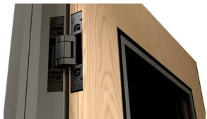
3-Axis Adjustable Concealed Hinge

Featuring a patented concealed hinge design, Alexis seamlessly integrates visual appeal with exceptional acoustic performance. Experience the pinnacle of sophistication and sound control with Alexis - where engineering meets elegance.