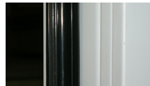
Proprietary Composite Silicone Polymer Compression Seal