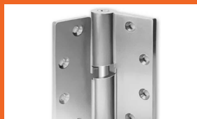
Standard hardware can be used