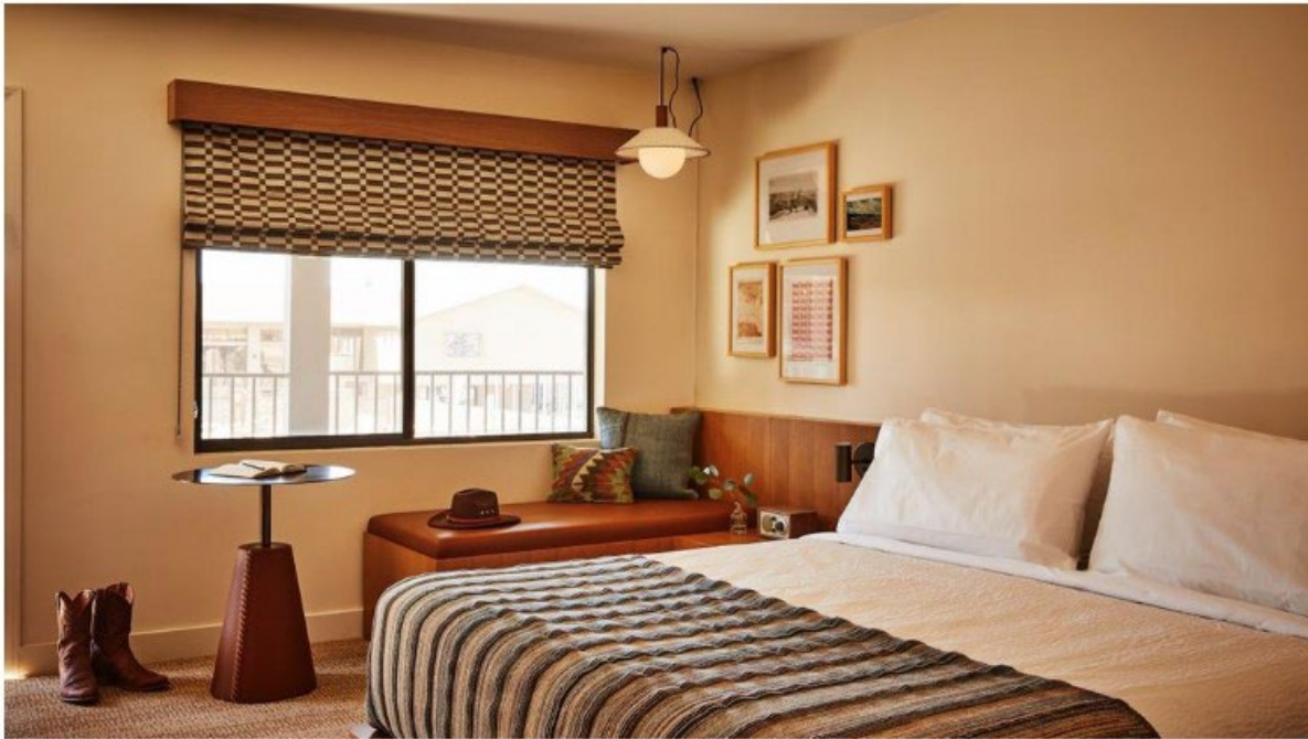
A room at Trailborn Grand Canyon.

There are 96 rooms, my room looks out to the new pool and spa, and is a short walk away from the outdoor firepit. It's immediately clear that this hotel has good bones with high ceilings and enough room to move in the bathroom. The feel? Warm and inviting. There's a velvet headboard, leather-stitched lamps, southwestern throw rugs, and soft lighting. Add to this a Tivoli Bluetooth radio to tune into songs from the road. The bathrooms feature Grown Alchemist amenities, there's even a cooler bag should you wish to take a picnic in the Grand Canyon.