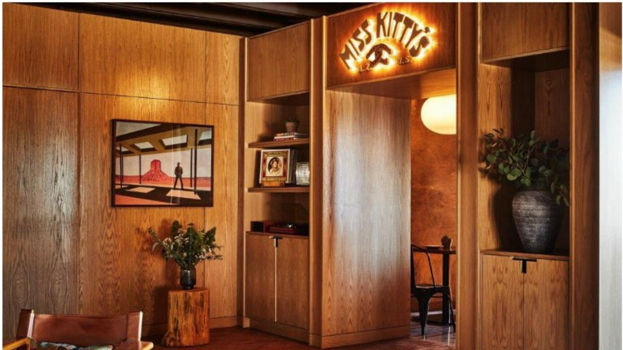
Onsite steak house Miss Kittys, where your choice of cut is grilled to order.

Trailborn has a 'Keep Extraordinary' initiative where a portion of every room booking goes to the Grand Canyon Conservancy with a focus on wildlife protection and trail restoration.