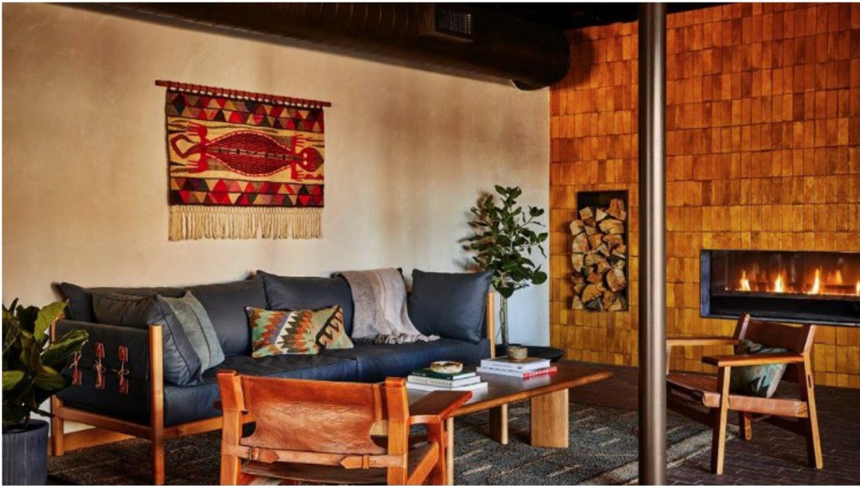
The welcoming hotel lobby.

It's all about laidback southwestern charm here. Guests are greeted with a welcoming Topo Chico sparkling water in the lobby which has all the hallmarks of a superbly done renovation that would appeal to any design fan. Think: warm curved woods, a yellow-tiled fireplace, a comfy couch under a beautiful vintage tapestry and a record player with Willie Nelson on the turntable. The interior designers took inspiration from the American West with fresh takes on classic 'old west' landscapes. And the neon sign and playful touches such as framed scenes from the past pays tribute to the retro motels of the mid-century days of Route 66.