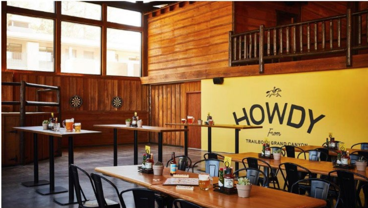
The Camp Hall at Trailborn.

The gloriously named Camp Hall serves as the social hub of the hotel where there's live music, darts, shuffleboard, movie nights and even wild west bingo. Alfresco, as well as the pool and spa there's bocce and cornhole, and outdoor speakers playing classic bangers as well as indie tunes. Trailborn offers free use of bikes and there's also off-site experiences they can organise led by local guides including helicopter rides, hikes in the Grand Canyon and astrophotography and stargazing, this area is renowned for its dark skies. Add to this the fact that The Historic Route 66 Association of Arizona will be hosting a plethora of events along the route in celebration of the centennial including fun runs, car shows and concerts.