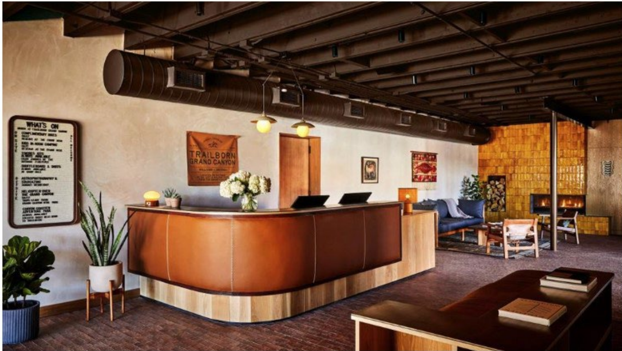
Checking in at the Trailborn Grand Canyon.

This is not just a town filled with vintage diners, old school bars and delightfully cheesy gift shops with Elvis fortune-telling machines and cowboy gear. There is also a good dose of newer businesses from breweries and a wine tasting room to the Canyon Coaster Adventure Park right next door to the hotel. It all makes for an enticing road trip combo. Williams is a 2.5 hour drive from Phoenix, a 30-minute drive from Flagstaff and a 3 hour drive from Las Vegas.