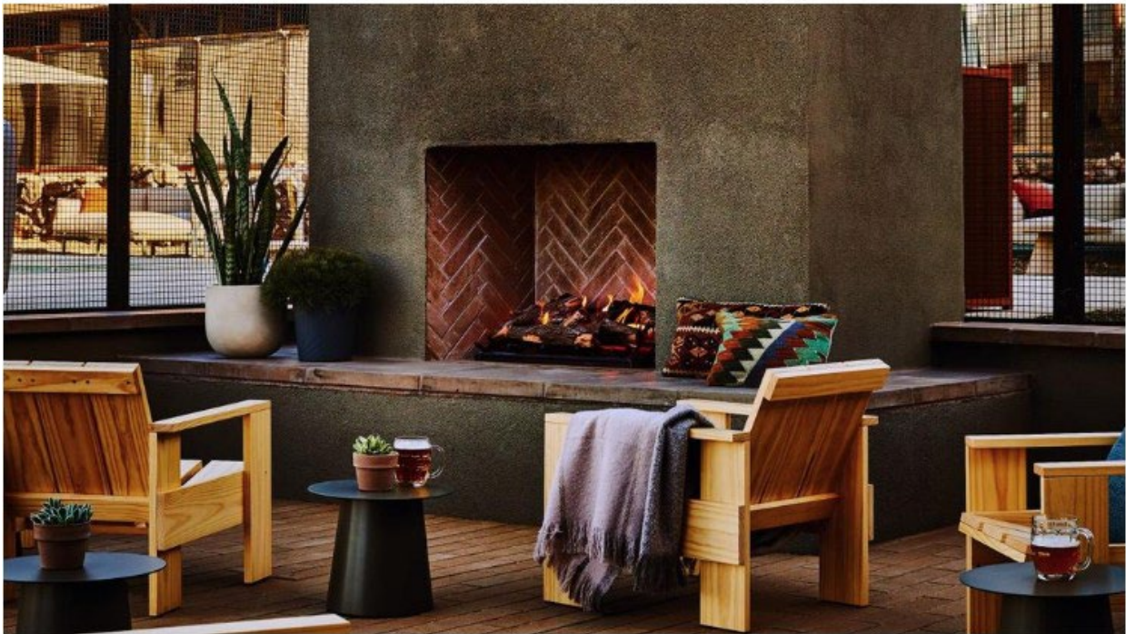
Gather fireside with marshmallows at the Trailborn.

Let's start with the s'mores. A kit filled with marshmallows, biscuits, chocolate and sticks is presented at check-in, and come evening, guests can gather fireside to melt the marshmallows for this taste sensation, best done after a meal at the onsite steak house Miss Kittys, where your choice of cut is grilled to order. There's indoor and outdoor seating, and a bar as well. They were just setting up on my visit but come summer this will be the perfect perch for their planned brunches. Within short walking distance are tacos from hole-in-the-wall restaurant Nany's, hot breakfasts at Goldies Route 66 Diner, scratch-made (a word used a lot around these parts) Key Lime pie at Pine Country and great pizzas at Italian restaurant Station 66.