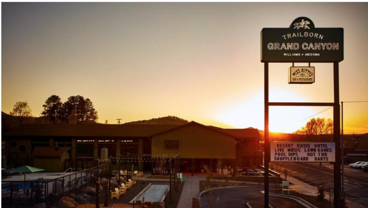
The Trailborn Grand Canyon.

Never heard of the town of Williams in Arizona? There's good reason why it should now be on your radar with the upcoming centennial celebrations of Route 66 in 2026. This is also the gateway town to one of the Seven Natural Wonders of the World, the Grand Canyon. It's home to the Grand Canyon Railway, a daily service that travels straight to the South Rim of the Grand Canyon, the most popular entry point to the park.