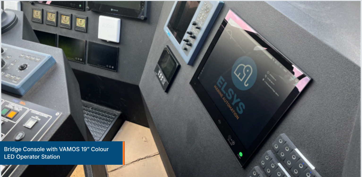
Bridge Console with VAMOS 19" Colour LED Operator Station

The AMS (Alarm Monitoring System) developed by ELSYS is an integrated platform for centralized monitoring and alarm management. It provides dedicated screens for real-time supervision of the battery system, PMS (Power Management System), offshore charging, and onshore charging.