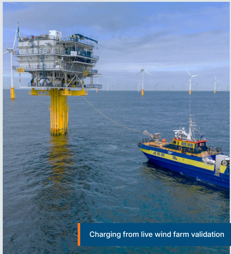
Charging from live wind farm validation