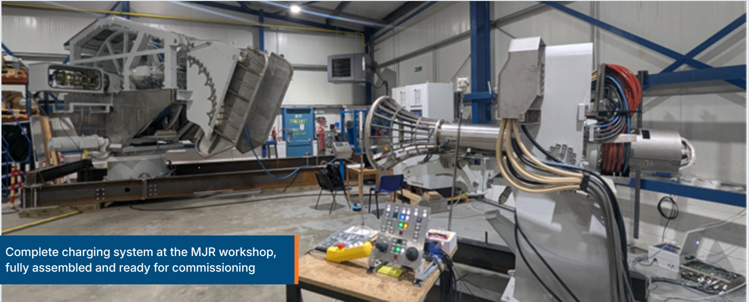
Complete charging system at the MJR workshop, fully assembled and ready for commissioning

The Offshore Charging System developed by MJR/ELSYS is a complete solution designed for the safe and efficient charging of vessel batteries within offshore wind farms. The system provides real-time monitoring, control, and protection functions, including dedicated interfaces for charging status supervision, power management, safety interlocks, communication diagnostics, and energy transfer performance.