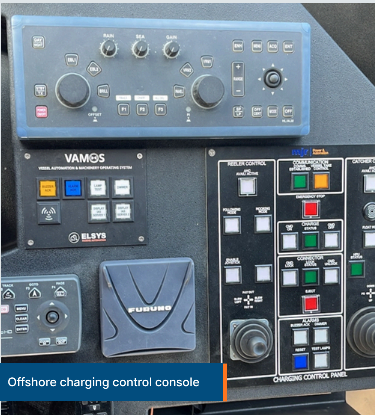
Offshore charging control console