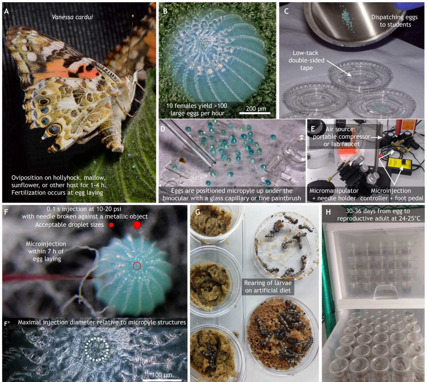
Fig. 1. Overview of the Vanessa cardui CRISPR procedure for laboratory courses. See Appendix 3 for details. (A) Oviposition occurs on hollyhock or mallow for 1–4 h; fertilization occurs at egg laying. (B) An egg with micropyle side up (as during injections). (C) Transfer of eggs from a metal bowl to each inverted cup lid lined with double-sided sticky tape (white arrow). (D) Egg flipping and positioning is done by the students under a binocular stereomicroscope. (E) An example of simple and economic microinjection set-up. (F,F') Egg microinjection to the micropyle within 7 h of egg laying. Injection volume (as measured in air) should be minimal, for instance, half the size of the micropyle structure (minimum and maximum droplet size indicated by filled red circles). (G,H) Hatchlings are fed artificial diet in small cups or plastic dishes and transferred at the third instar stage (G) to individual small plastic cups until pupation (H), after which they are frozen before characterization.

(journal-style article on results or a bioethics position piece, see below); and (4) gain practical skills for joining the scientific workforce. Once these learning goals were defined, we identified learning outcomes to achieve these goals, including technical, knowledge-based and analytical outcomes, and their associated assessments (Table 1).