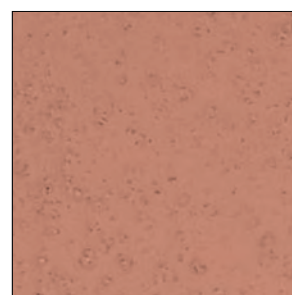
Terra Cotta 01-8081