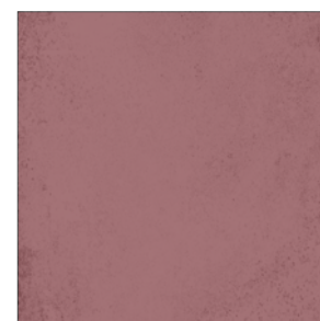
NY Red 01-3031

StreetBond 1 Campus Dr. Parsippany, NJ 07054 855-444-9977 www.StreetBond.com