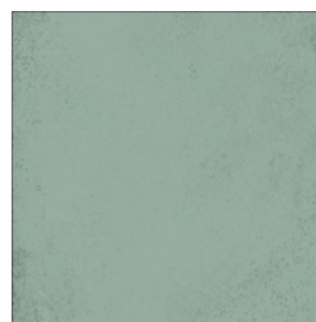
NY Green 01-6021