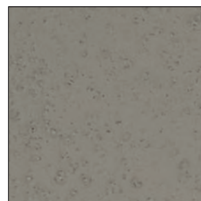
Medium Gray 01-7030