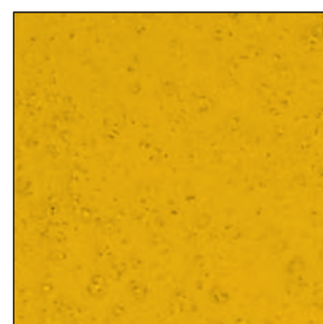
Traffic Yellow 01-1023