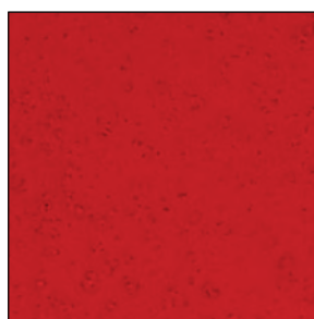
Bright Red 01-3000