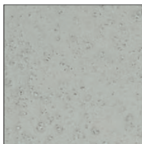
Light Gray 01-7035