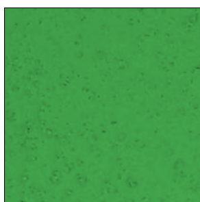
Bright Green 01-6018