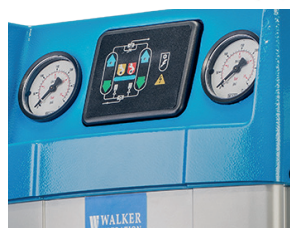
Illuminated Display Controller

Easily accessed for reduced service time