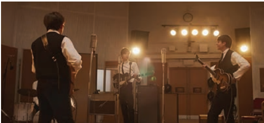
MOVIES OF LAKE WORTH: JAN. 13 | 7:00 PM MANDEL JCC, PALM BEACH GARDENS: JAN. 14 | 7:00 PM