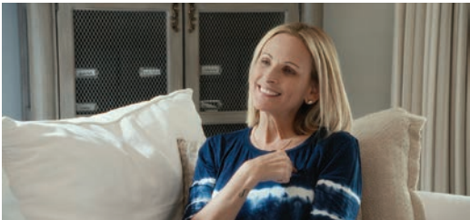
MANDEL JCC, PALM BEACH GARDENS: JAN. 26 | 4:00 PM MOVIES OF LAKE WORTH: FEB. 10 | 4:00 PM