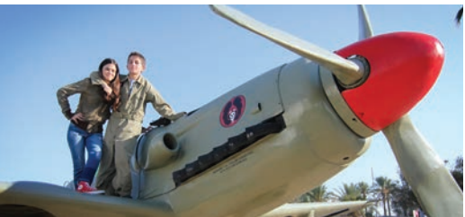
MANDEL JCC, PALM BEACH GARDENS: JAN. 25 | 1:00 PM MOVIES OF LAKE WORTH: FEB. 8 | 1:00 PM