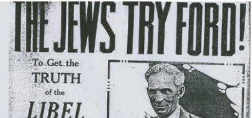
MANDEL JCC, PALM BEACH GARDENS: JAN. 29 | 1:00 PM BOYNTON BEACH CINEMARK: FEB. 5 | 4:00 PM