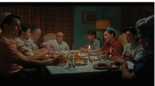
MANDEL JCC, PALM BEACH GARDENS: JAN. 28 | 7:00 PM