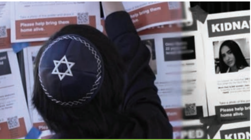
MANDEL JCC, PALM BEACH GARDENS: JAN. 29 | 4:00 PM