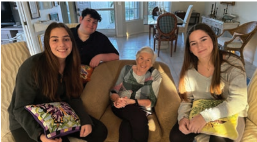
MANDEL JCC, PALM BEACH GARDENS: JAN. 27 | 4:30 PM

DOCUMENTARY | FILM LENGTH IN MIN | DIRECTED BY TEENS AT MANDEL JCC ENGLISH | 2025 | USA