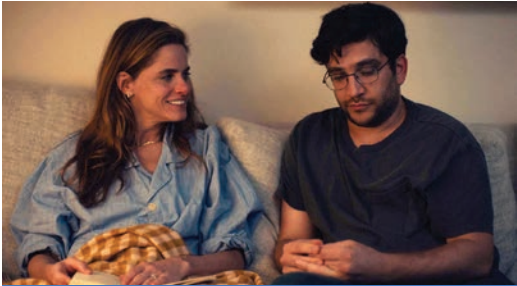
MOVIES OF LAKE WORTH: FEB. 12 | 4:00 PM

DRAMEDY | 91 MIN | DIRECTED BY MATTHEW SHEAR ENGLISH | 2025 | USA