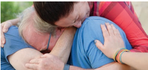
MANDEL JCC, PALM BEACH GARDENS: JAN. 29 | 4:00 PM