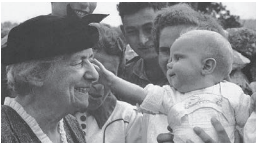
MANDEL JCC, PALM BEACH GARDENS: JAN. 26 | 1:00 PM