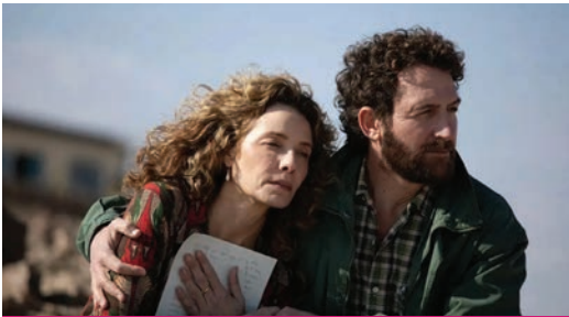
BOYNTON BEACH CINEMARK: JAN. 31 | 7:00 PM