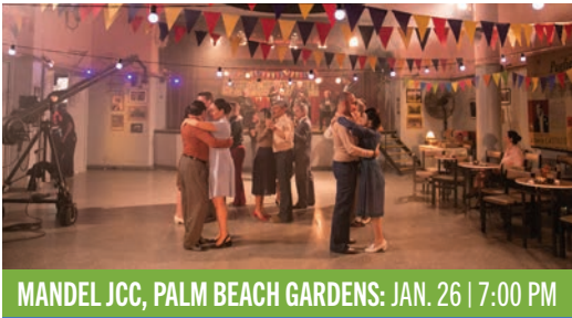
MANDEL JCC, PALM BEACH GARDENS: JAN. 26 | 7:00 PM