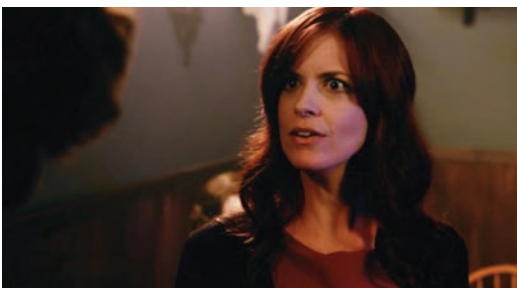
BOYNTON BEACH CINEMARK: FEB. 3 | 4:00 PM