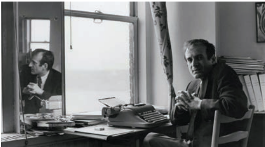
MANDEL JCC, PALM BEACH GARDENS: JAN. 28 | 4:00 PM