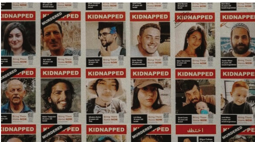
MANDEL JCC, PALM BEACH GARDENS: JAN. 25 | 7:00 PM